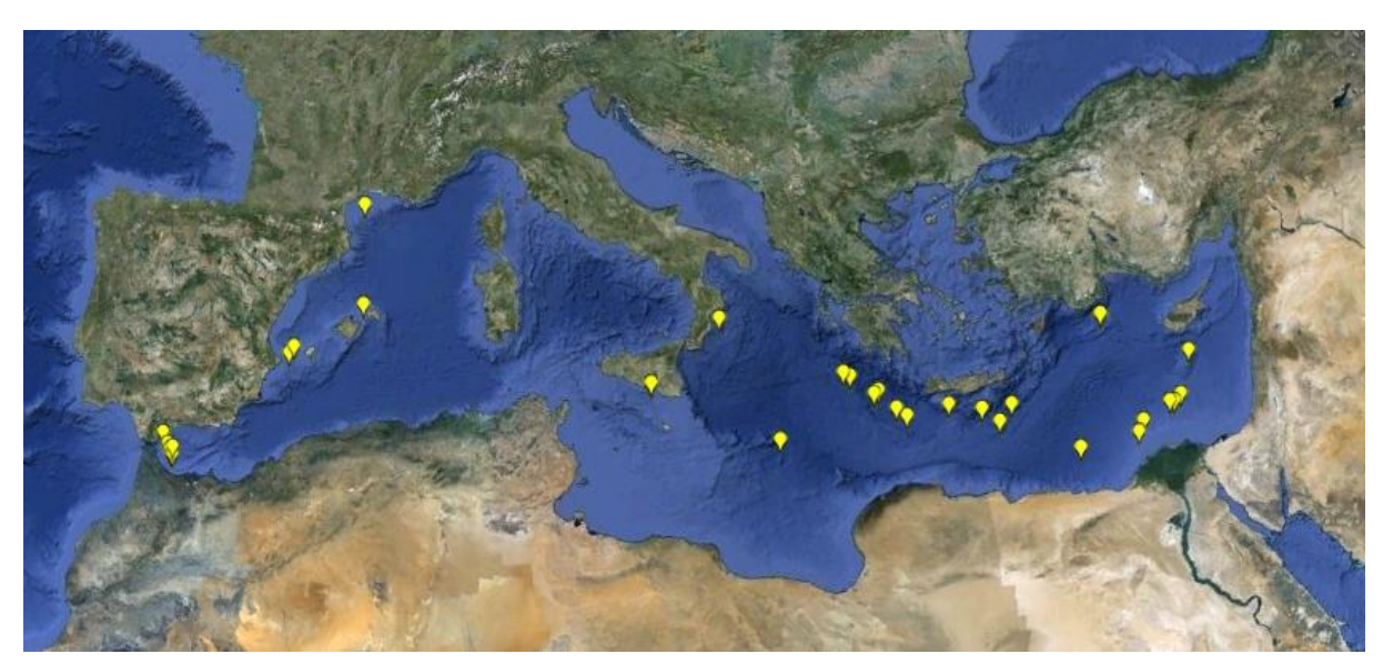
Figure 3: Locating chemo-synthetic populations that have been studied in the Mediterranean (after authors of Document & [6], [12], [13], [14], [15]).

'Cold seeps' seem to be well represented along the Mediterranean fold (eastern basin; Figure 3). 'Mud volcanoes' are frequent in the eastern basin especially at the level of the Mediterranean fold and in the south-east of the basin, but the discovery of 'pockmarks' around the Balearic Islands allows us to envisage their existence in the western basin (Acosta et al., 2001, in [12]; Figure 3). Lastly, six hyper-saline anoxic lakes have been localised at the level of the Mediterranean fold [4] (Figure 3).