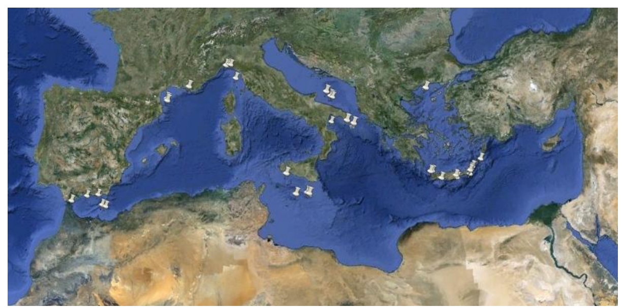
Figure 2: Location of some populations of structuring invertebrates in the Mediterranean. These are mostly 'deep water corals' (after authors of Document & [8], [9], [10]).

Their presence can thus be a necessary precondition for setting up specific measures. Although at present they are still not much taken into account in terms of conservation, since only the Santa Maria de Leuca reef with Lophelia and Madrepora has since 2006 been included as a restricted fishing area by GFCM [11], they are at the origin of the creation of MPAs (e.g. the Cassidaigne and Lacaze-Duthiers canyons, France). Similarly, two sites have been chosen to this effect by Italy (Continental slopes of the Tuscan Archipelago and Santa Maria de Leuca sector) for setting up the Natura 2000 at-sea network, and many are included in the proposal to set up a representative MPA in the Sea of Alboran [6].