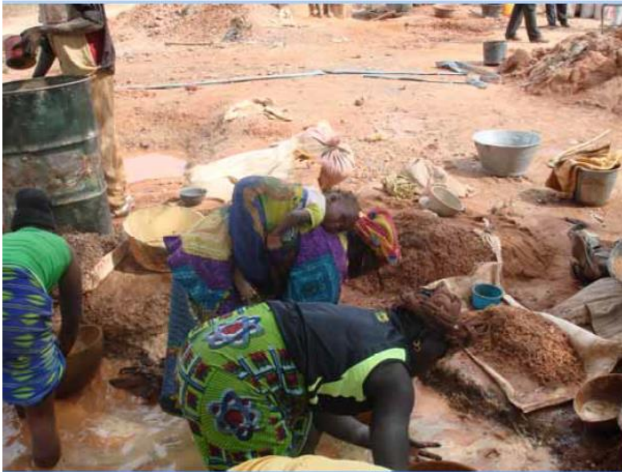
UNIDO, Mali, 2009