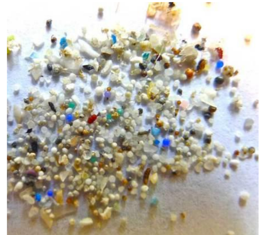
Microbeads from Cosmetics Disposal in Great Lakes