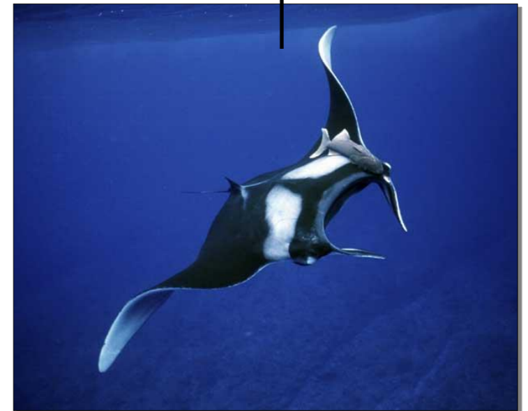
Manta Ray - Nature