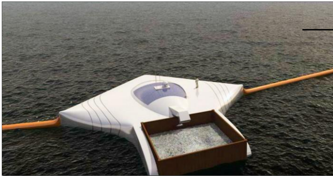
Boyan Slat - Ocean Cleanup Foundation

“The first signal of human intention is design” ~ William McDonough