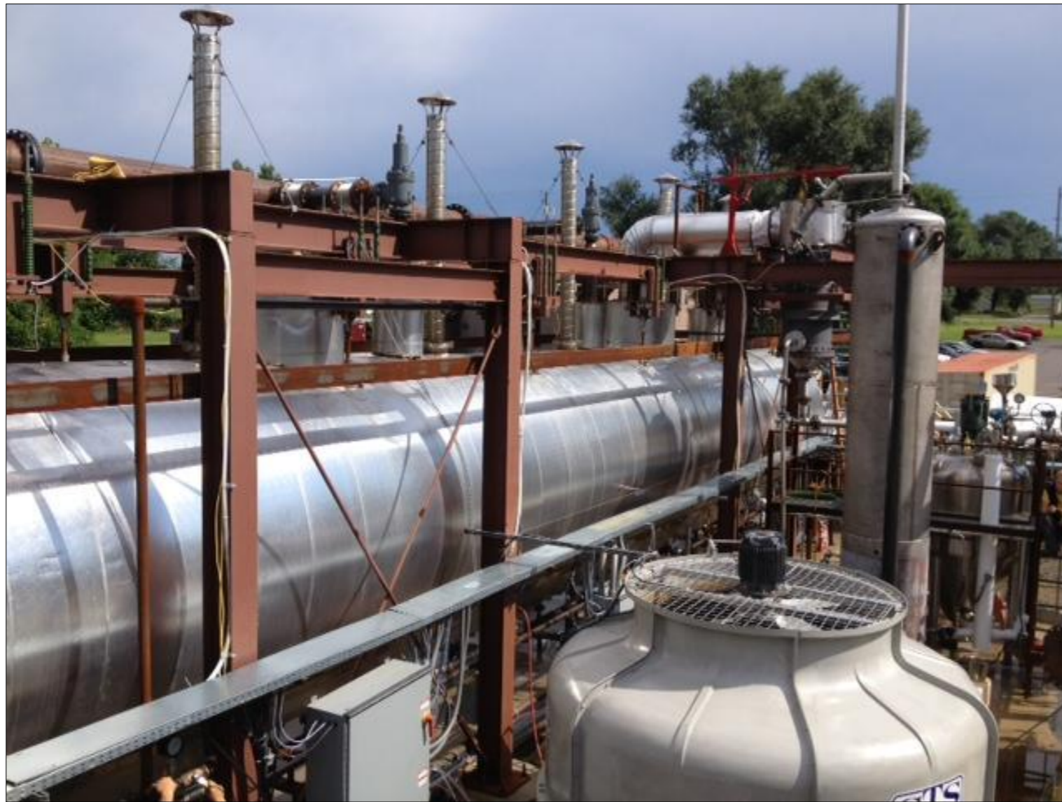
Perry, Ohio facility