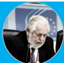
George Dassis, President of the European Social and Economic Committee (EESC)

With the UN 2030 Agenda world leaders agreed on a common vision and roadmap addressing the key challenges of our time. In its core this global agenda is about equity and fairness: it is about how we share our economic and natural resources fairly in a world with a growing population and limited natural resources. SDGs are not only important for European external and development policies, they are also critical for our domestic policies. Ending poverty and reducing inequality, “leaving no one behind” continues to be a huge challenge in the EU. The European Economic and Social Committee is ready to support a full implementation of the Sustainable Development Agenda and suggests to set up a European Sustainable Development Civil Society Forum, in order to make the voice of civil society truly heard in this process.