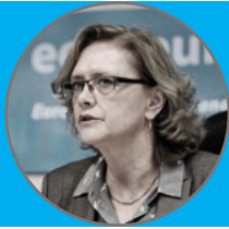
Monika Linn, Principal Adviser, United Nations Economic Commission for Europe ( click here for presentation )

For the UNECE region (from Canada to Kazakhstan), there are many common challenges compared to the challenges in the EU (EU members are half of all UNECE members), but some are different, for example, for our Eastern member states. The UNECE helps with issues like transport agreements, vehicle regulations, labelling of chemicals, environmental conventions, standards on trade facilitation, agricultural quality and PPP standards, classification for energy and minerals and more. The UNECE is looking into the linkages from the High Level Political Forum with the regional forum for SD, between the regional review mechanisms and the national review mechanisms. The regional review mechanisms, the environment and innovation performance reviews and the review mechanisms for conventions need to be aligned to the SDGs.