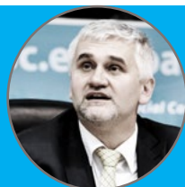
Jan Dusik, Director Regional Office for Europe, United Nations Environment Programme (UNEP)

In light of the current global political context, the SDGs are probably the best set of universal goals that we could get. There are still hurdles such as the threat to reduce full participation of civil society in the UN system, although we are hopeful that we will win this fight as many member states and the EU are on the side of civil society. Civil Society is ready to start work on monitoring the implementation, but is also waiting for a EU strategy and action plan to implement all the 17 goals in Europe.