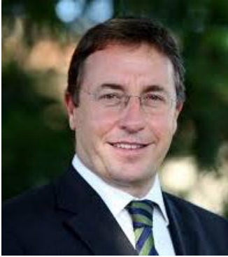
Executive Director, UNEP

The United Nations General Assembly in 2006 unanimously elected Mr. Achim Steiner as Executive Director of the United Nations Environment Programme for a four-year term, and subsequently for a further four years in 2010. Following the decision of the 68th General Assembly of United Nations, Mr. Steiner's mandate has been extended for two years up to June 2016.