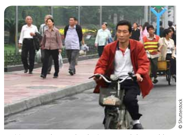
Positive examples are developing around the world, from South America, Africa and Europe to North America and the Asia-Pacific.