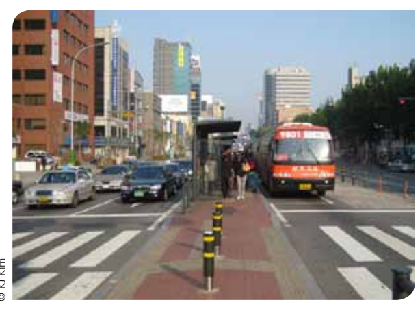
Many governments are increasing investments in walking and cycling as part of their wider plans for creating sustainable urban transport systems.