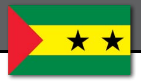
Figure 1: Energy profile of São Tomé and Príncipe