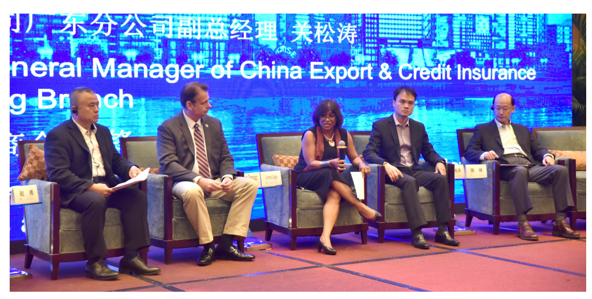
Panelists at the session

about thirty minutes beyond the scheduled time. The key recommendations of this event will serve as inputs for the UN Science-Policy-Business Forum, taking place in Nairobi from the 2-3 December 2017 leading up to the UN Environment Assembly, under the banner "Science for Green Solutions."