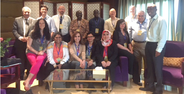
Review Editors at the Guangzhou meeting