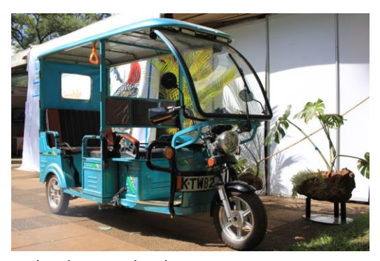
The Electric Tuk Tuk

Dave TukTuk's new electric Tuk Tuk¹ provides a non-polluting and silent transport system for Kenya's urban and rural areas. The vehicle has fuel costs at 12.5% of what a gas-powered vehicle does. This electric Tuk Tuk is meant to be an alternative to the current noisy and polluting Tuk Tuk. The company notes that the most important thing is education in the market. Often, people hear about the electronic Tuk Tuk and do not understand what it is. They are aiming to sensitize people in order to successfully introduce this new Tuk Tuk. To date, they are the only company in East Africa offering this product and are aiming to sell to the mass market.