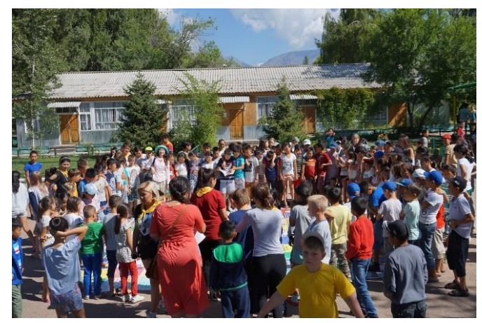
8) Children's Health Center "Barchyn" (Issyk-Kul oblast, Sary-Oi village)

Number of children: 52 Number of posters: 10