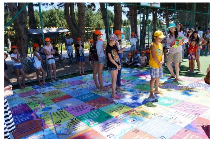
9) Children's health camp "Dzerzhinets" (Issyk-Kul oblast, Chok-Tal village)

Number of children: 460 Number of posters: 10