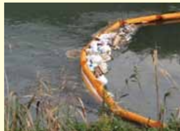
Survey of litter using oil fence

A survey on the distribution of litter in Oyabe River and its tributaries, the amount of litter input to the sea via rivers, and the amount of marine litter has been undertaken. The results were shown on a map to consider the areas/locations in need of priority measures.