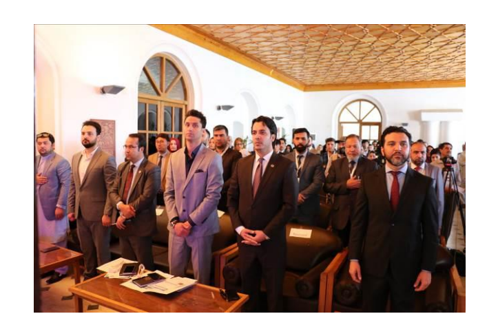
Annex 2: Pictures [World Ozone Day Celebration 16th September 2019]