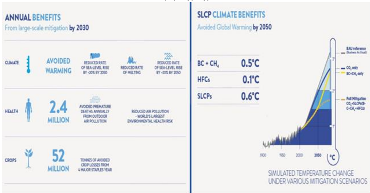
Figure 2: What are the benefits of reducing SLCPs

The speed at which SLCPs can be removed from the atmosphere presents an opportunity for quick multiple development benefits. The CCAC takes action based on solid science. The activities follow a package of control measures identified by UNEP and the World Meteorological Organisation (WMO) for their ability to achieve “win-win” results for the climate, air quality, and human wellbeing over a relatively short timeframe, at little to no net cost.