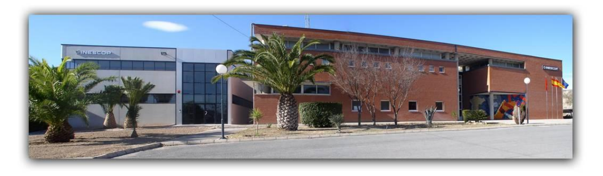
Figure 1. INESCOP's Headquarters in Spain

INESCOP, the Spanish Footwear Technology Institute, is an independent service organisation. INESCOP began its activities in 1971 and works as a private non-profit making organisation.