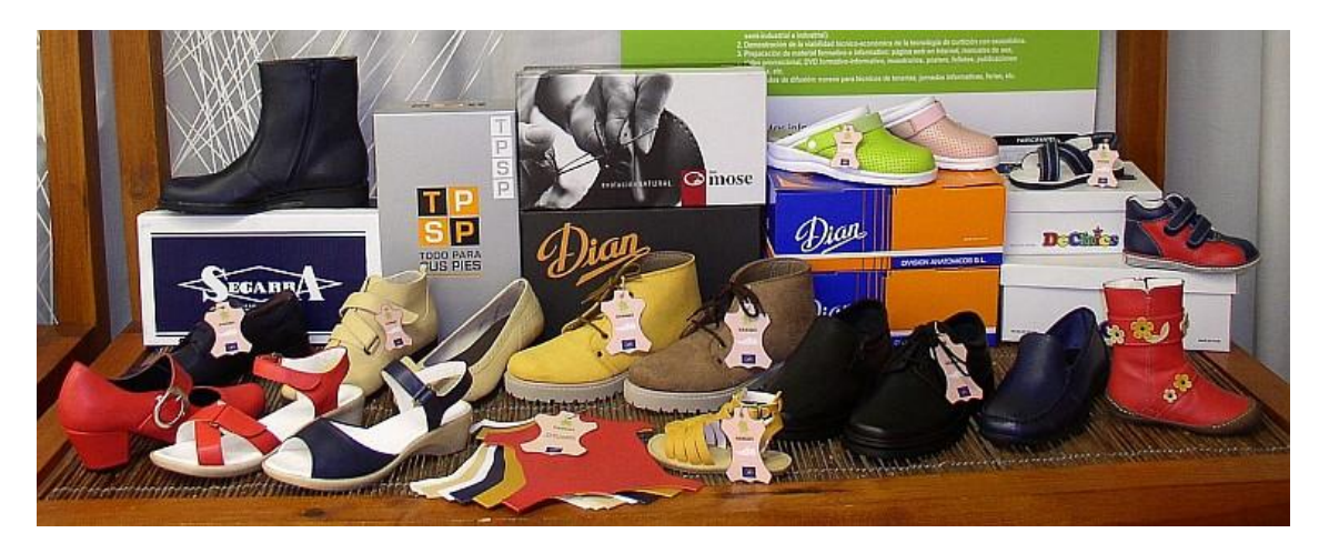
Figure 2. Footwear samples manufactured with oxazolidine leather

3) EU Project " Demonstration of clean technologies in tanning processes in Egypt (LIFE04 TCY/ET/000045 - ECOTAN)" aiming to boost the environmental Egyptian capacities for the tanning sector. The main results were: