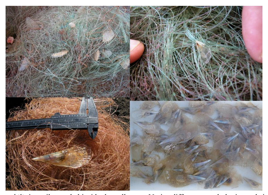
Fig. 4 . Pinna nobilis juveniles settled inside the collectors. Notice different morphologies and sizes. Juveniles have to be kept in seawater immediately after extraction from the bags.

At the end of the installation period juveniles' sizes (antero-posterior length) may range approx. from 0.5-9 cm. In general, they can be seen by the naked eye inside the tangled fibers (Fig. 4). They have to be removed carefully in order not to break the fragile valves. Juveniles should be immediately placed in seawater after their extraction from the collector bag (Fig. 4).