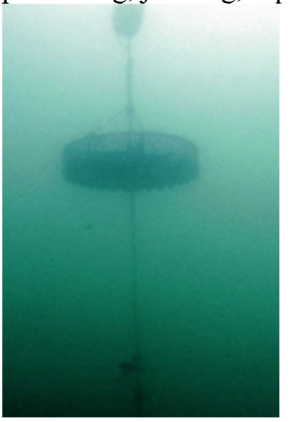
Figure 1Horizontal collector

We then proceed with the preparation of the captation structure (Figure 1) consisting of 1 ballast, a rope with a maximum length of 2 meters, a float and the collector. Among the 2 collection systems tested (vertical and horizontal) the horizontal system was preferred. A circular lanter-net (plastic devices used in ostrey maricoltures) is therefore used on which it is possible to fix various types of textile material to increase the efficiency of collection. Simplest method is put inside the lanternet some textile material like potato-bag, jute bag, ropes etc. This method help juveniles to attached helding larvas.