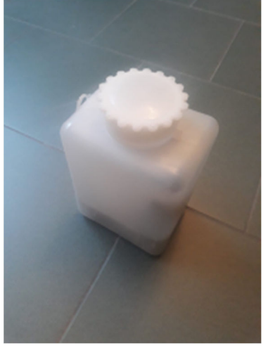
Figure 4 Plastic-box for collected organism