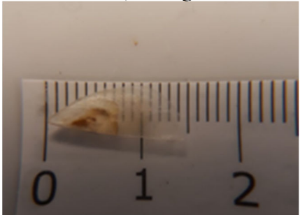
Figure 2 Juvenile Pinna nobilis

Once collected, the organism is transported in a box paying particular attention to not stress it.