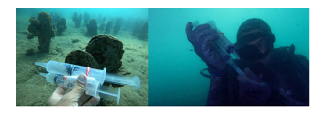
Figure 7 Underwater operations

pellets. After sampling, biological material are conserved in alcool ( 90^{\circ} ) and put in freezer at - 80^{\circ} C, ready for the genetic analysis.