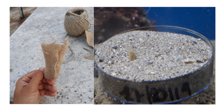
Figure 6 Juta bag and Petri dish

For stabling and growth operations, attention must be given above all to maintaining the optimal chemical-physical conditions. Although the Pinna nobilis is a very resistant and adaptable bivalve mollusc (it survives even for short periods out of the water) we try not to produce large fluctuations in the tanks during normal maintenance operations. The photoperiod should be adjusted according to the seasonality of collection and gradually varied according to the progress of the seasons. As far as the growth is concerned, it is possible to proceed with the insertion of nutrients or, if the tank already has a started ecosystem (at least 5 cm of sediment, different stones, vegetable and animal organisms present) then it is also possible not to insert nutrients for the fans. If the tanks instead are only filled with water without any kind of ecosystem started, then it is recommended to insert once a week a microalgal culture concentrate in the tank.