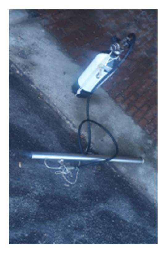
Figure 5 Sorbonne

should see the byssus attached to the solid substrate. Usually, the fin sticks to a few little solid bodies, which can be a rock or a very large rock. In case the byssus is attached to a removable stone we proceed with the extraction of the fin with the whole stone. If the fin is attached to a rock, then proceed by cutting the byssus in the proximity of the rock without damaging the byssus gland.