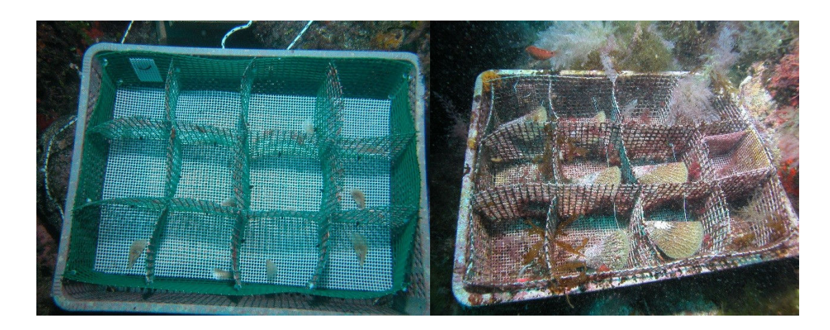
Fig. 5 . Left. Juveniles just extracted from the collectors and placed in the protection cage (in the field). Right. Pinna nobilis individuals of approx. 2-3 years of age in the protection cage. Notice the photographs have been taken without the mesh protection covering the cages.

Juveniles can be placed in protection cages in the field where they will continue growing, giving the possibility of re-implanting them in suitable substrata when a certain size is reached (Fig. 5). See Kersting & García-March (2017) for further information.