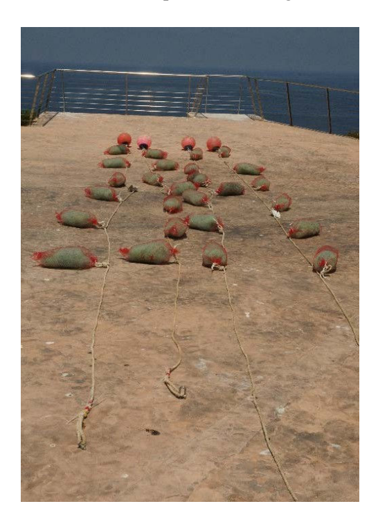
Fig. 2. Collectors' bags attached to the main rope and buoy ready to be deployed.

The bags are attached to a main rope (Fig. 2). The whole system is fixed to a small concrete mooring (or similar, but it must be heavy enough to prevent dislocation by waves and currents) and the rope is kept vertical by a submerged buoy. Submerged buoys (depth > 3m) prevent the whole system to be seen from the surface and potential entanglements with boats.