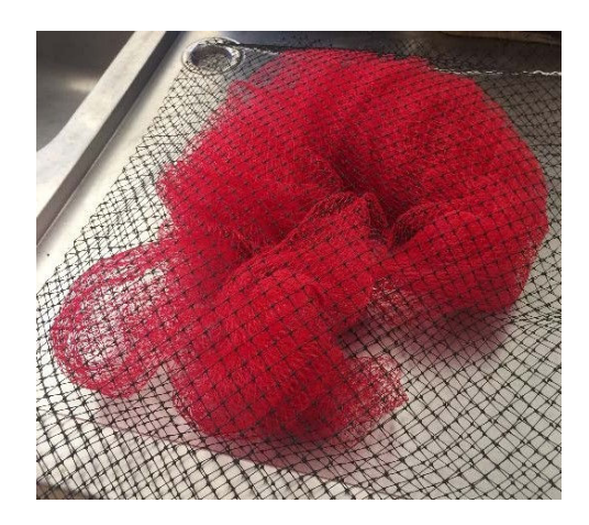
Fig. 1 . Two different bag designs. Left. Entangled nylon (trammel net) inside plastic mesh bags. Right. A similar outer plastic bag but using onion nets as substrata inside.