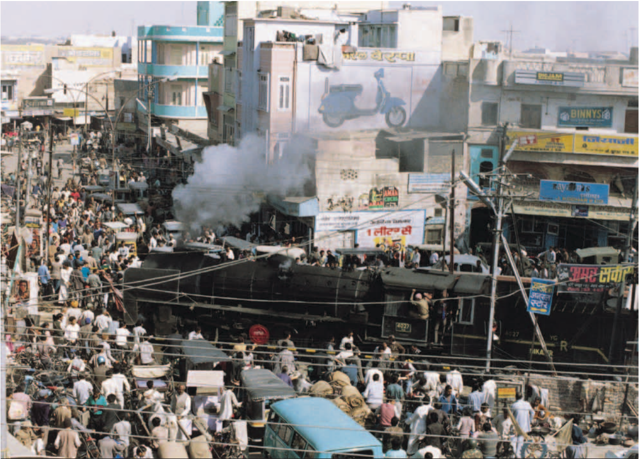
● 80% of air pollution in developing countries can be attributed to the transport sector

developing world cities, such as Lima in Peru, an average of four hours a day are lost by people who live and travel within the city. 62 This translates into a loss of about US$ 6.2 billion or 10% of GDP per annum. 63