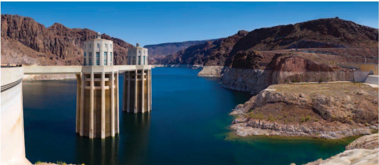
● Almost 1 billion people do not have access to clean drinking water