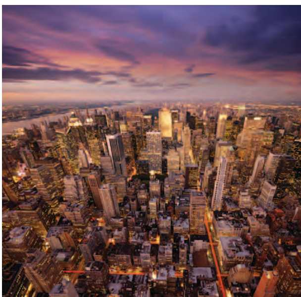
● Cities are vulnerable to global price fluctuation

Cities in the developing world face the greatest future pressures emerging from global resource constraint and climate change effects and the rapid growth of urban populations. They are also where the need for transitioning to low-footprint, low-carbon growth in a way that simultaneously addresses pressing social and economic challenges is most urgent. Most existing city infrastructures in developing world contexts aren't adequately equipped to cope with the pressures under which they are now placed, so it is difficult to envisage how these cities will cope with the global and climate change effects.