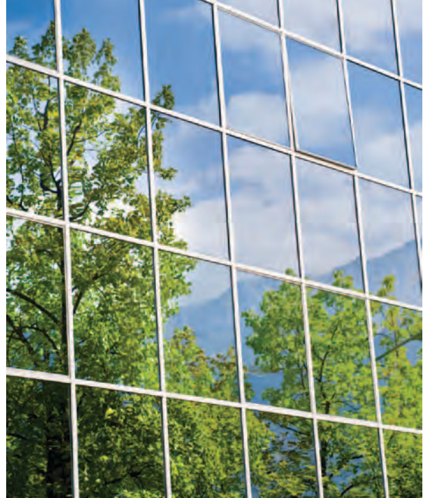
● Building energy efficiency alleviates pressure

five key thematic areas for informing city infrastructure choices, each of which integrates across a range of sectors and resource constraints that may be affecting them. These include: