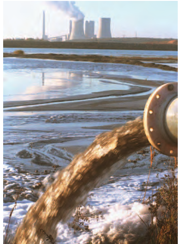
● Waste water treatment has also become a major challenge for cities that are experiencing high population growth levels

Water scarcity challenges are not new to cities but the increasing urban population pressures place huge demands on existing potable water provision and wastewater abstraction processing plants. Cities in both the developed and developing world are extending their reach into ever more remote locations to access water to meet the needs of