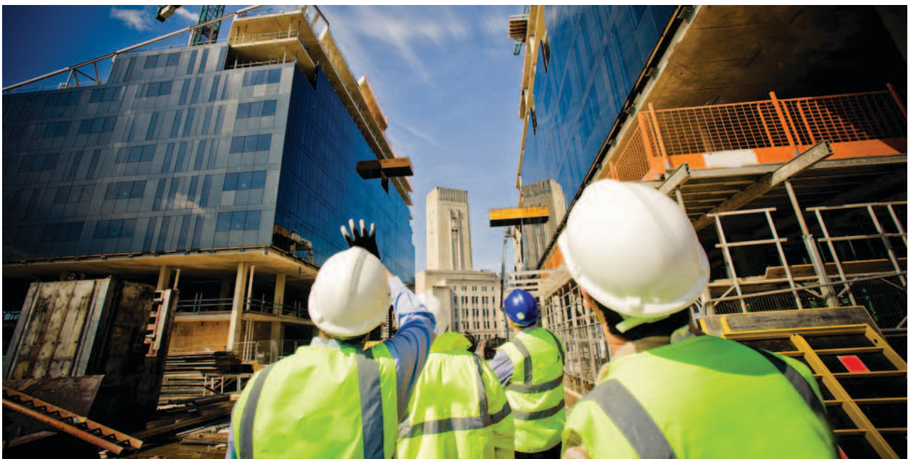
● Residential and commercial buildings are responsible for nearly 60% of global electricity