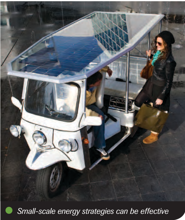
● Small-scale energy strategies can be effective

solar panels, solar-chargers and solar-battery chargers. The city of Rhizao in China is a solar-powered city where 99% of households within the central districts make use of solar water heater geysers. 135 The 2011 GER Cities Report states that: