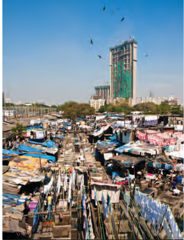
● High levels of inequality persist in cities

However it is important to acknowledge that, at a global scale, it is the consumption patterns of the developed world – and a global economic system of consumption-driven growth that reproduces these consumption patterns across the world – that are largely responsible for the destruction of critical life-supporting ecosystems such as rainforests, and for the production of the GHGs that influence the global climate. The developing world has played a negligible role in bringing about the larger-scale, global changes, yet remains more