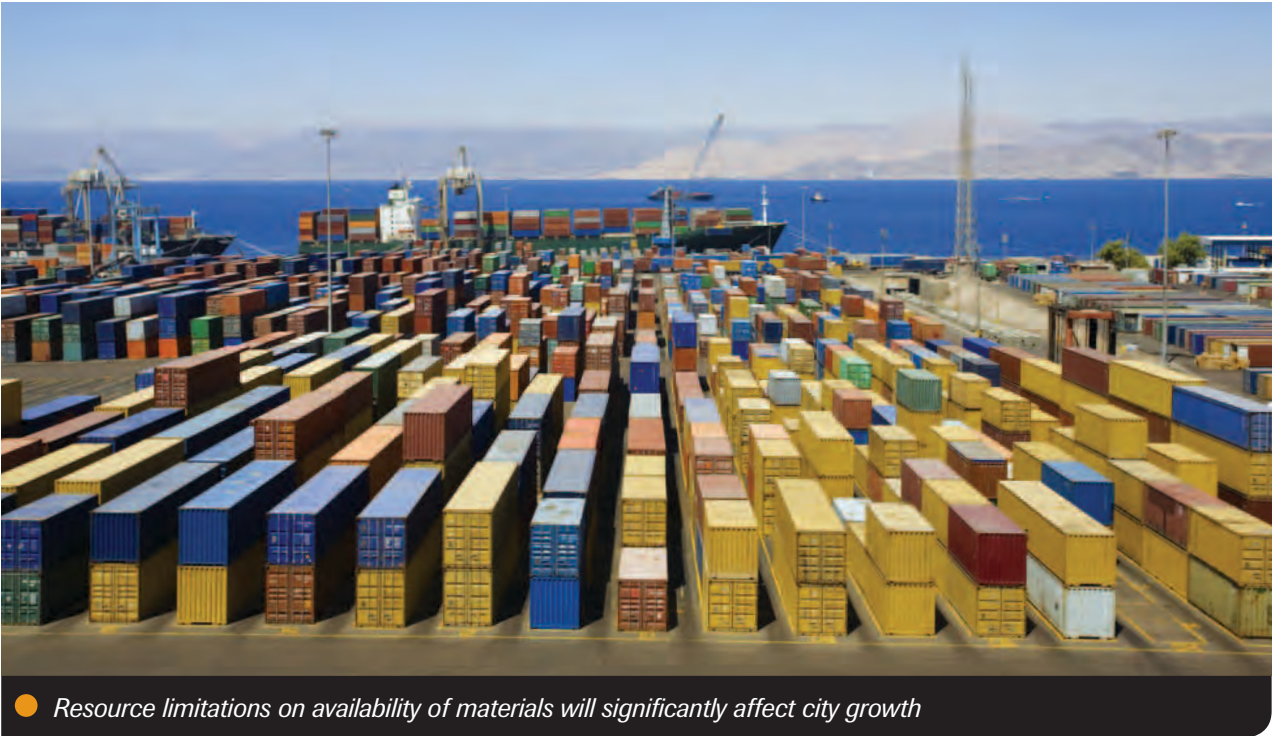
● Resource limitations on availability of materials will significantly affect city growth

to ‘urbanisation rates’ it is important to clarify what is being counted i.e. urban land area, percentage urban population size increase, or total urban population size increase. By all these measures, however, African and Asian cities are projected to grow significantly, absorbing most of new global growth. It is therefore clear that the challenges faced by developing world cities in particular will intensify as it is mainly African and Asian cities that will struggle to meet the challenges of the second wave. Many of them are unable to meet their current challenges effectively, much less those of the future.