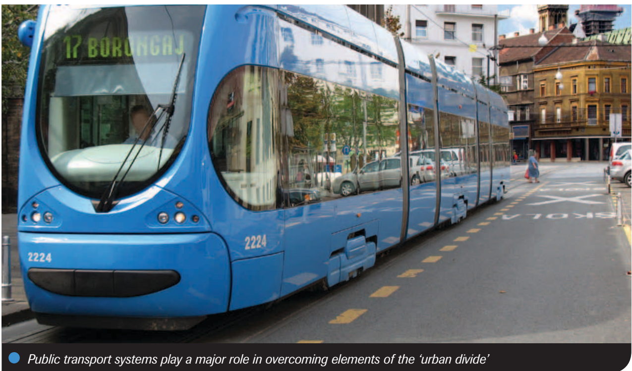
● Public transport systems play a major role in overcoming elements of the 'urban divide'