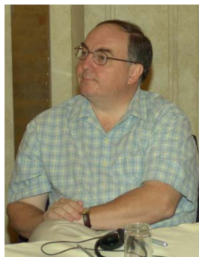
Representative from the Canada-Iraq Marsh Initiative (CIMI)

One of the successful initiatives of the programme is the "Consultation Workshop on Mesopotamian Marshlands Management" that was held in Amman, Jordan last 19-22 June 2004 to identify the priorities and focal areas of interest to Canada. The workshop also attempted to straighten the direction and refocus the targets of the financial support. Workshop results focused on critical elements that are obviously needed: (a) ensuring acquisition of current information and data on the marshes; (b) creating a national database of credible and scientific data; (c) completing a National Marshes Plan and fully activating lead agency (CRIM) responsibilities; (d) establishing coordination of partnership/ donor assistance; (e) creating a capacity building programme with a broad group of government, university and NGO institutions; (f) identifying/training/hiring qualified staff for project execution; and (g) establishing a national university-based marshes research network and targeted marsh projects as