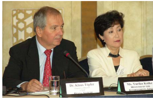
Ms. Yuriko Koike, Minister of Environment of Japan, and Dr. Klaus Töpfer, the UNEP Executive Director

world but also to Japan. Japan had been able to rebuild itself from the World War II destruction through the assistance of various countries, in addition to the determination and efforts of its people. This experience has made Japan determined to assist the people of Iraq in restoring their society to one where people can live with security and peace of mind. She underlined that it is important to pursue the process of nation building in terms of sustainable development, in which economic, social and environmental aspects are all considered in a balanced way.