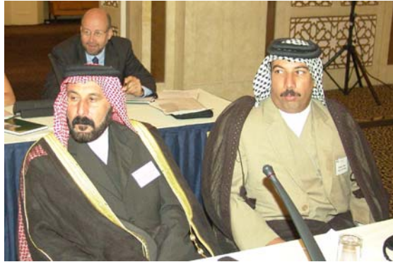
Representatives from Marsh Arab communities

Another Iraqi representative stated that the marshes need clean water quickly for the citizens and their children