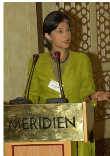
Representative from the UN Cluster on Poverty Reduction and Human Development

Partners exist at different levels. IREP is closely coordinating and implementing its activities with the local counterparts, these are: local councils, municipal departments (agriculture, water and sanitation, sewage, public works and health), local communities and private sectors. On the other hand, in a parallel implementation mechanism, UNDP has partnered with 7 international NGOs to assist in implementing labor-intensive components of their activities in Iraq, including: Islamic Relief, Care International, War Child, Advocaid, International Medical Corps, Coopi, and Qandil. Three of these international NGOs (Care international, War Child, International Medical Corps) have projects in the Southern Governorates on street and riverbank cleaning, sewerage system repairs, and hygiene and environmental education provision.