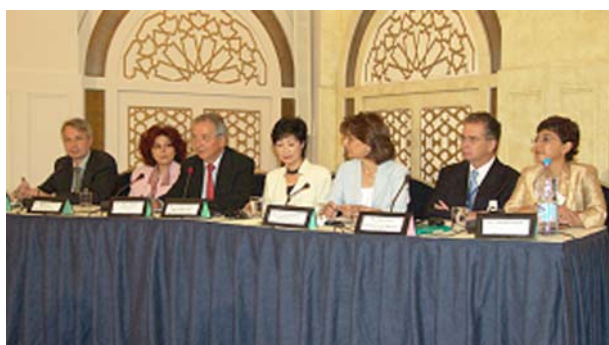
The members of the opening session consisting of the Ministers of Environment of Iraq, Japan and Jordan, and representatives from UNEP and UNAMI