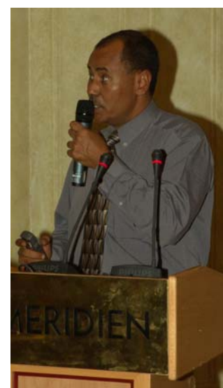
Representative from the UN Cluster on IDPs and Refugees

He highlighted the objectives of their comprehensive and community-based approach to reconcile and reintegrate the people to the marshlands. These included provision of community based support, affordable shelter, quick-impact projects in key service sectors (e.g. education, water and sanitation), and capacity building to enhance sustainability. He mentioned some activities in the marshes and their achievements. Despite the security constraints, the cluster is almost close to accomplishing its tasks but is very much willing to identify areas of possible links to UNEP Marshland Restoration Project.