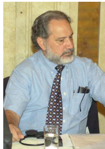
Representative from the UN Cluster on Agriculture, Water Resources, and Environment

He emphasized several issues to address within the cluster as follows: (a) apply integrated community approach; (b) identify livelihood needs; (c) select support programmes; (d) provide input to sustain initial livelihood activities; (e) identify and provide technology transfer requirements; and (f) identify areas of support to civil governance in the marshlands. The UN Cluster 5 takes a holistic approach in supporting livelihoods and sustainability and makes sure that every action is built upon Iraqi expertise, human resources and capacities. Partnership between other UN agencies, local institutions, and NGOs also exists as well as addressing gender issues and prioritization of vulnerable communities especially in the lower south.