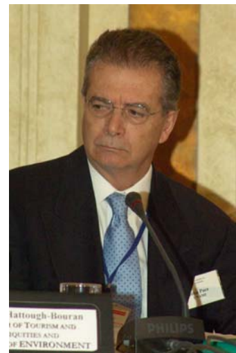
Representative of UN Assistance Mission for Iraq (UNAMI)