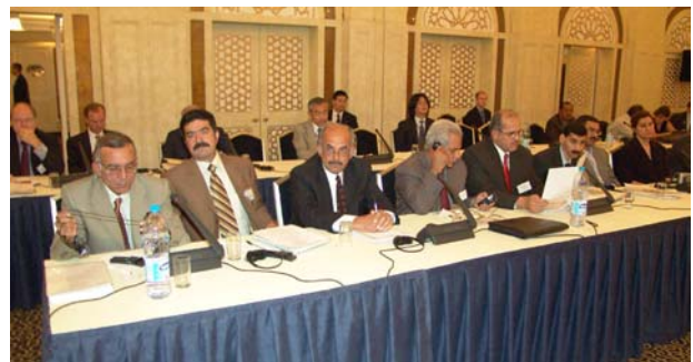
Representatives from various Iraqi ministries