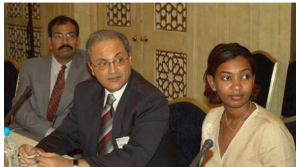
Representatives from the international community