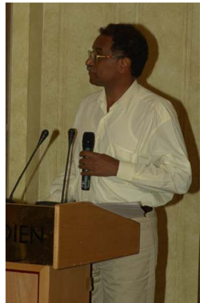
Representative from the UN Cluster on Health

A representative of WHO, which is a member of the Health Cluster, presented the second cluster's on-going activities, and achievements thus far. The cluster adopted the 1981 World Health Assembly, Resolution No. 34.38 as their mission, which states "the role of physicians and other health workers in the preservation and promotion of peace is the most significant factor for the attainment of health for all." They have carried out a number of nationwide campaign and door-to-door activities such as polio immunization, proving health can be a bridge for peace.