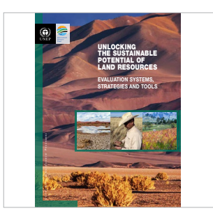
Unlocking the sustainable potential of land resources: Evaluating systems, strategies and tools

Better matching of land use with its sustainable potential is a "no-regrets" strategy for sustainably increasing agricultural production on existing land, targeting restoration efforts to where they are likely to be most successful, and guiding biodiversity conservation initiatives.