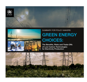
Green Energy Choices: The Benefits, Risks and Trade Offs of Low Carbon Technologies for Electricity Production

The GEO 6 regional assessment recognizes Africa's rich natural capital - the diversity of soil, geology, biodiversity, water,landscapes and habitats- which if wisely managed, hold the promise to lead the region to a future where ecosystem integrity,as well as human health and well-being are continuously enhanced.