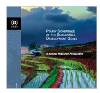
Policy Coherence of the Sustainable Development Goals