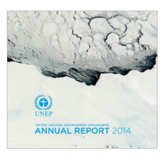
United Nations Environment Programme: Annual Report 2014