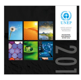
United Nations Environment Programme: Programme Performance Report 2014