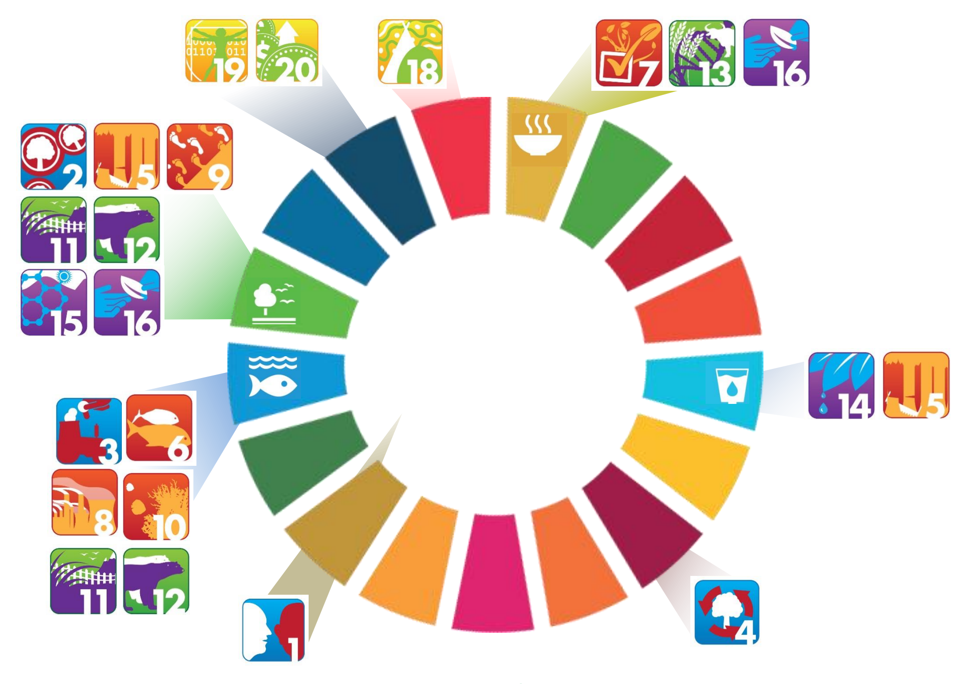
The Aichi Targets are reflected in several SDGs