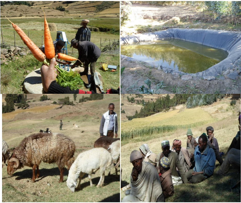
Ethiopia demonstration site: Some project beneficiaries and examples of project achievements . (Photos: S. Heileman, Dec 2013)

91. It could be argued that some of the pilot adaptation interventions were no different from a typical rural poverty reduction programme. But, as stated in the project document, the project was expected to contribute to poverty reduction in the basin countries as defined in their national poverty reduction strategies and national development plans. This is in line with the recognition that poverty exacerbates the potential negative impacts of climate change by limiting the capacity of the poor to manage climate risks.