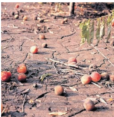
Orchard swamped by tailings, Aznalcóllar, Spain

Guidance for the Mining Industry in Raising Awareness and Preparedness for Emergencies at Local Level