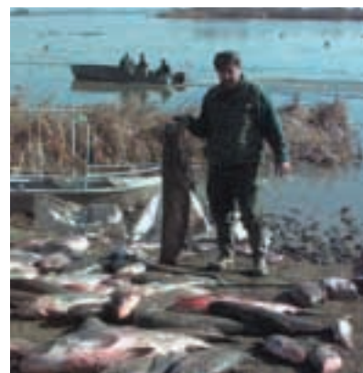
Fish killed by cyanide spill at Baia Mare, Romania