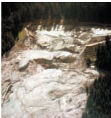
Fatal failure of tailings dams at Stava, Italy