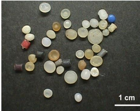
Plastic resin beads, used in plastics manufacture (Ogata)

Operational definition – particles < 5mm