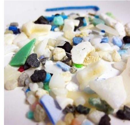
Beach sample of microplastics, Hawaii