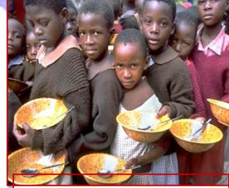
The global Paradox

The two first have been "lost in Translation"