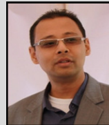
Mahesh Pradhan Chief, Environmental Education and Training Unit, UNEP/DEPI