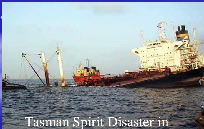
Tasman Spirit Disaster in Pakistan