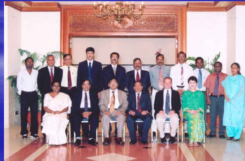
Regional Workshop on Marine Litter