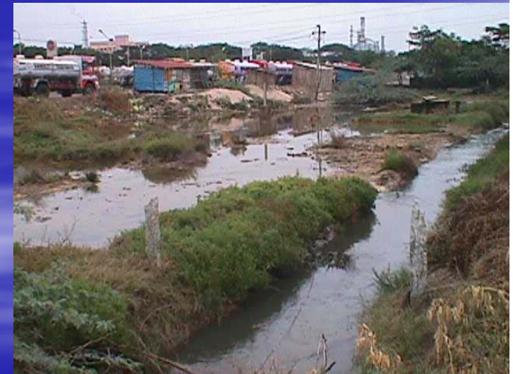
Release of wastewater from small industries into creeks