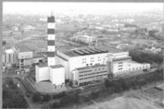
Kyoto city MSW incinerator