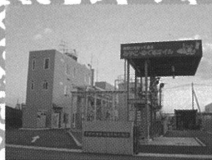
Kyoto city BDF plant