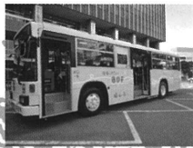
Biodiesel Okayama (Producer of biodiesel fuel)