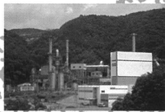
Eco-System Sanyo (hazardous waste incinerator)