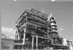
Eco-System Okayama (ASR recycling plant)