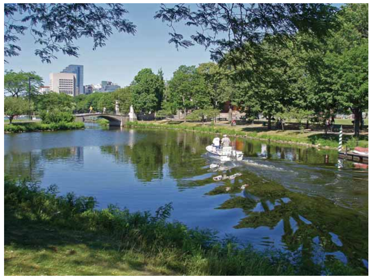
The Charles River Esplanade, Boston, Massachusetts, U.S.A. July 2005

Urban policymakers and planners need to incorporate risk-sensitive, sustainable watershed management as part of development and land-use planning, in order to build urban resilience against water-related hazards and the effects of climate change. In the past, watershed management approaches heavily utilized engineered technology such as dykes or river channelling and were typically much more centralized at the national level. Recent experiences in effective watershed management have moved towards an ecosystem-based approach, which may still be complemented by engineered solutions as appropriate. Sustainable watershed management balances water needs amongst multiple users while it protects the long-term ability of ecosystems to capture, store and release water. Incorporating risksensitivity in watershed management regulates resource use (i.e. land and water) in order to prevent or reduce the impacts of water-related hazards and to develop coping capacities to recover from these hazards.