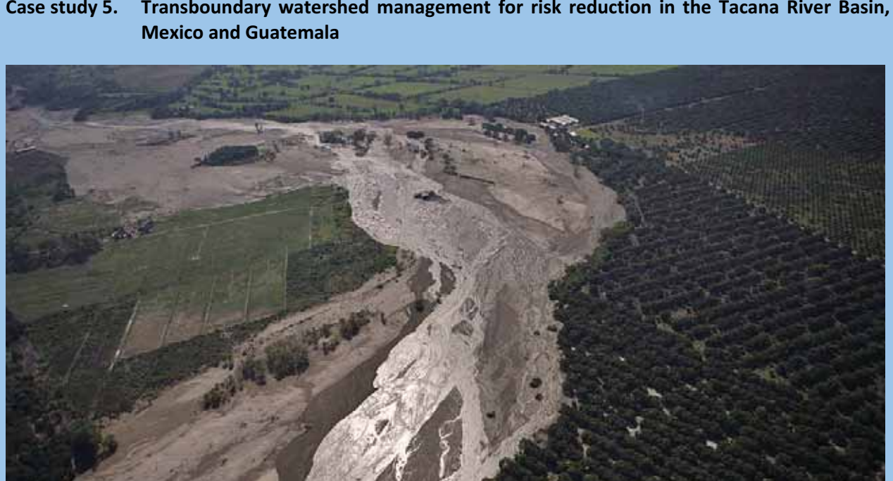
Transboundary watershed management for risk reduction in the Tacana River Basin, Case study 5.

In 2005, Hurricane Stan caused severe flooding and mudslides in Guatemala and Mexico, with over 2,000 deaths and material damages of up to USD 40 million. Roads, bridges, water supply systems, crops and other livelihood assets were destroyed. The devastation served as a catalyst to reduce the impact from future hurricanes.