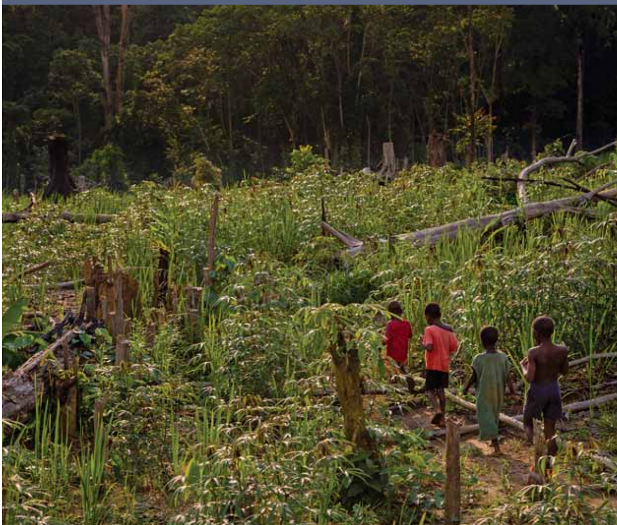
Sapo National Park in Liberia is located in the southern county of Sinoe near the city of Greenville. The park represents the largest remaining section of primary rainforest in West Africa. After leaving the nearby Sinoe Rubber Plantation, many ex-combatants moved into Sapo National Park and began destructively exploiting gold mines and harvesting timber

To address this problem, UNMIL and the Forestry Development Authority (FDA) created the “Sapo Working Group”. Sensitization meetings and alternative livelihoods programmes were put in place to incentivize miners to leave the park. In addition, newly discovered diamond mines outside of the park attracted a number of miners to also leave. Eventually, however, the FDA had no choice but to attempt a forced evacuation of the remaining 1,000 miners left in the park. Those miners who were also ex-combatants requested entry to the DDR programme at the time, though the programme had by then closed after three opportunities for registration had been offered across the country. Failure to directly link the DDR programme with the occupation of the park meant that many ex-combatants were not able to benefit from reintegration support. In addition, the park suffered considerable damage from the mining activities taking place, which undermined government authority over the area. 142