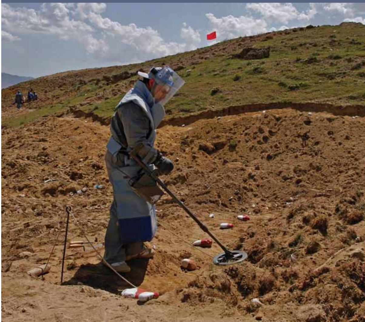
A deminer of the Afghan Technical Consultant Demining works on a minefield in Aka-Khail village in Bagram north of Kabul, Afghanistan, April 2010

Following the signing of the Bonn Peace Agreement in December of 2001, Afghanistan had an estimated 100,000 combatants to be disarmed, demobilized and reintegrated into society. Through the Afghanistan's New Beginnings Programme (ANBP), thousands of ex-combatants were trained in community-based de-mining skills, given literacy classes, and offered vocational and community mobilization training. These former combatants were then referred to the UN Mine Action Center for Peace and recruited as part of the Mine Action for Peace Programme (MAFP) and employed for a minimum of 12 months.