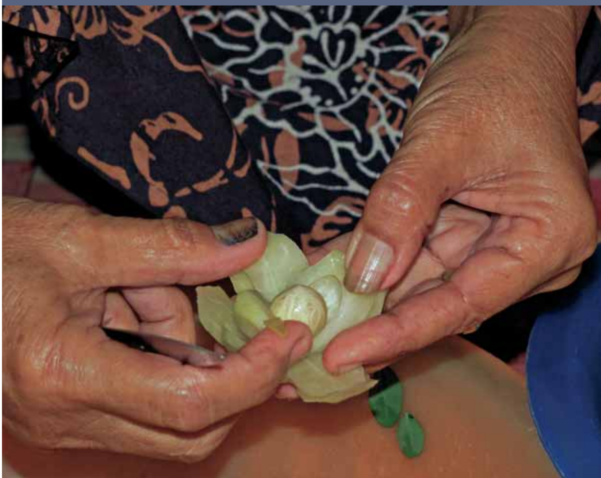
Women in Aceh Selatan supplement their income by making nutmeg fruit candies for local markets, whereas the seed and mace of the nutmeg is used to produce essential oil

Enhancing livelihoods and economic opportunities for intended beneficiaries requires the active collaboration of many actors and institutions. Forum Pala Aceh (Aceh Nutmeg Forum), established through this programme, and related government institutions, have all collectively participated in the implementation of the value chain strategy, covering cultivation, processing and marketing. 131 Particular efforts were made to engage business enterprises in strengthening supply chains and linking local producers and farmers. The product diversification trainings have not only improved their technical skills and knowledge of nutmeg farmers, but have also enabled them to expand their markets to other districts.