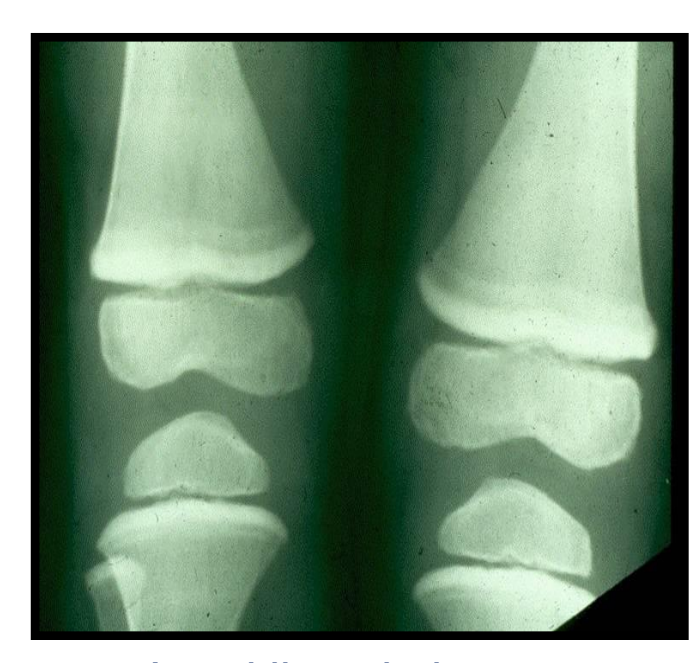
Lead lines in bone