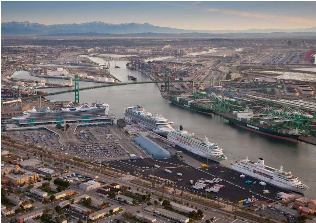
Figure 3 Port of Los Angeles