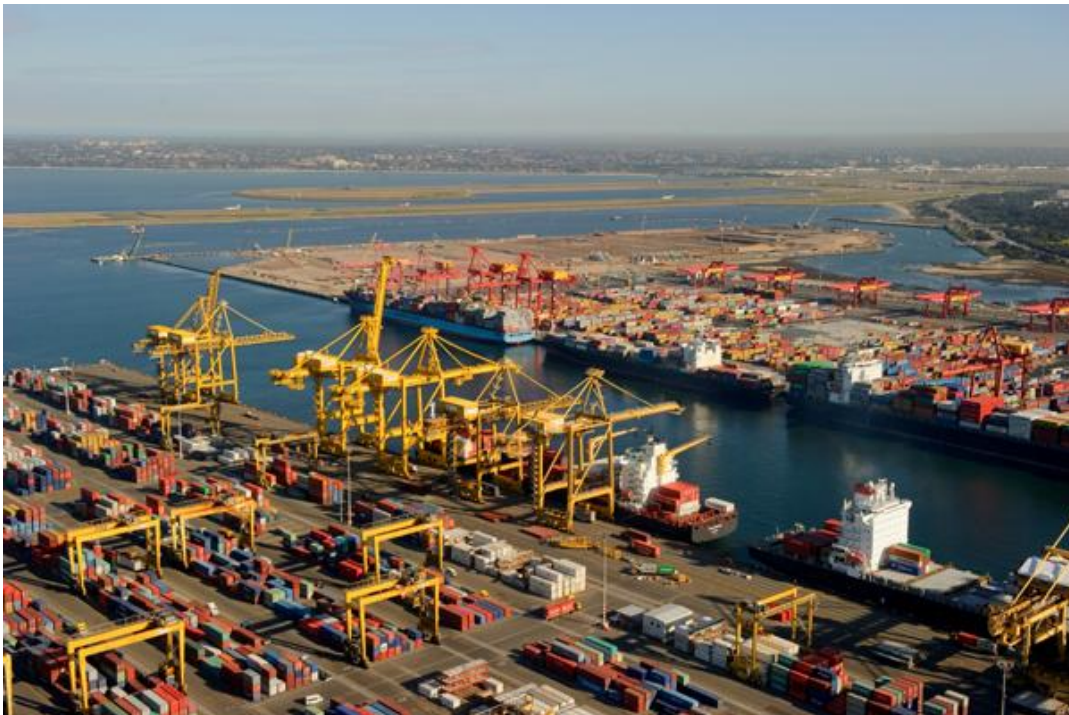
Figure 4 Port of Sydney