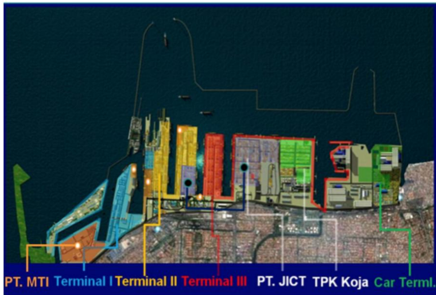
Figure 5. Layout of Port of Tanjung Priok

For long, central and local governments has been implementing air quality program in the Port of Tanjung Priok from ambient air quality monitoring to emission test of pollution sources in the port area. None of them include emission inventory.