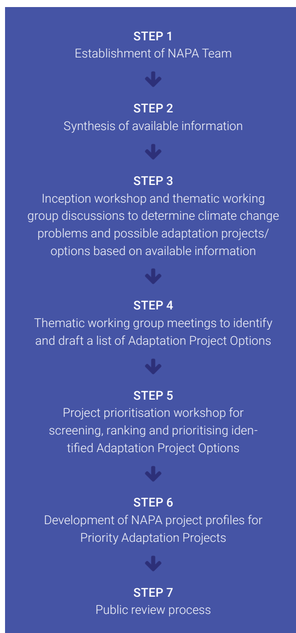
Figure 2: An outline of the steps used in the South Sudan NAPA preparation process.

The preparation of the NAPA was guided by a participatory process, involving multiple stakeholders from the public sector, private sector, NGOs and academia. Furthermore, the NAPA adopted a multidisciplinary and complementary approach building on existing plans, programs and national sectoral policies. The main objective of the consultative process was to publicise the project activities, and solicit inputs and feedback from all stakeholders on the identification and prioritisation of Adaptation Project Options. Because of the tense political situation and potential security risks in South Sudan at the time that the NAPA was prepared, stakeholder consultations with