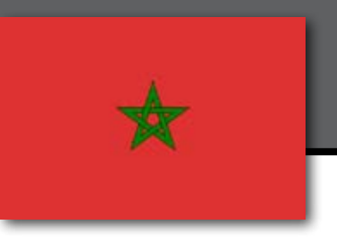
Figure 1: Energy profile of Morocco