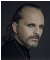
Miguel Bosé , Singer and environmentalist

For the past 30 years Miguel Bose has been a major force in Latin Music, crossing all genres but always maintaining an electronic beat. He grew up with Picasso and Ernest Hemingway, who were family friends. In 2007 to