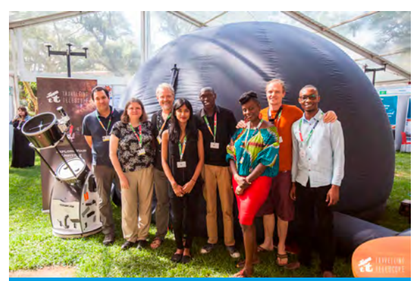
The International Planetarium Society and the Traveling Telescope teams working together to make the Planetarium at the Sustainable Innovation Expo a success.