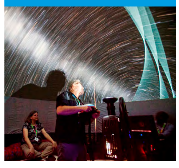
Inside the planetarium during one of the Planetarium Chats.