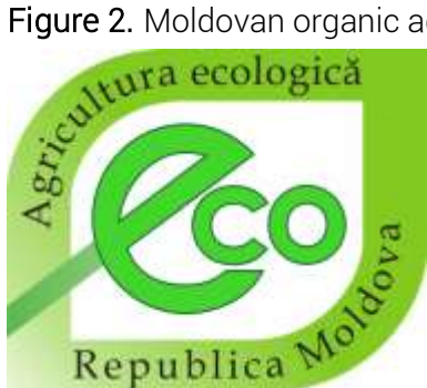
Figure 2. Moldovan organic agriculture logo

Image: Agricultura Ecologica - Republica Moldova