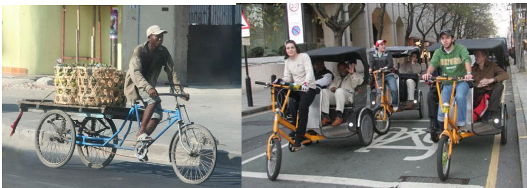
Freight tricycle in Tanzania (left) and passenger rickshaws in London (right)

In many countries of the world, including Asia, Latin America and Europe, human-powered tricycles are used for passenger transport (cycle rickshaws) and freight. They are mainly used in urban and peri-urban areas as they operate best on good infrastructure. Bicycle trailers are also used for passengers and freight transport, but only at a fraction of the level of tricycle use. In many cities, including London, human-powered tricycles provide taxi services that are both more comfortable and safer than boda-boda bicycles.