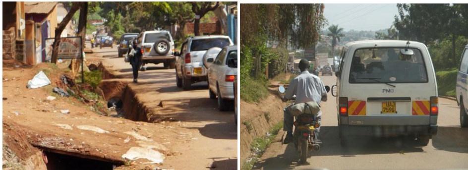
Some roads in Kampala that are risky for NMT as they are narrow with open drains and no footways