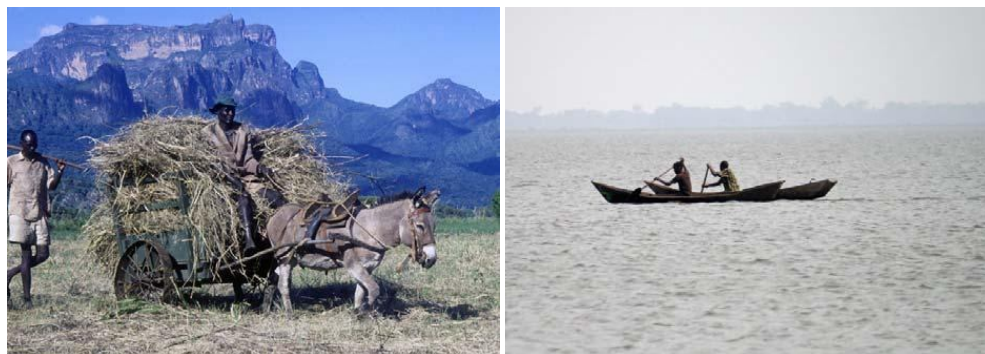
Locally-important forms of non-motorised transport in Uganda: Left: Donkey cart; Right: Canoes

This policy is focused on the major forms of non-motorised transport in Uganda, namely walking and bicycling. Other forms of non-motorised transport are also important in particular areas and to certain people. These include canoes and small boats on the many lakes and rivers of Uganda. They also include ox carts, donkey carts and pack donkeys. Handcarts and wheelbarrows are also forms of non-motorised transport as are wheelchairs and human-powered tricycles. All these forms of transport benefit from appropriate infrastructure, safety and welfare considerations, regulation and enforcement.