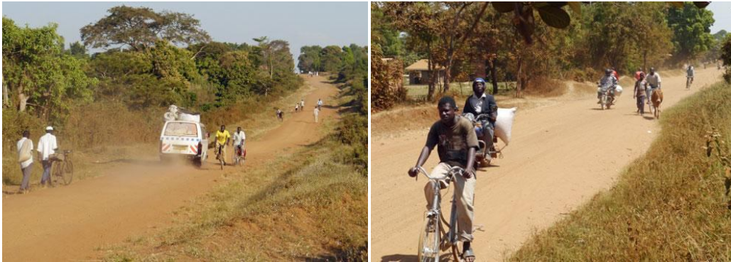
Road sharing is practicable at low levels of traffic, provided all road users are considerate

District and community roads have no provision for pedestrians and bicyclists. This is generally reasonable for low traffic volumes (eg, fewer than 30 vehicles an hour), when motorists, pedestrians and bicyclist can share the road effectively. NMT move to the side of the carriageway when a vehicle approaches. It becomes more difficult if the motorists drive at excessive speeds and/or road traffic increases, particularly if the road is dusty.