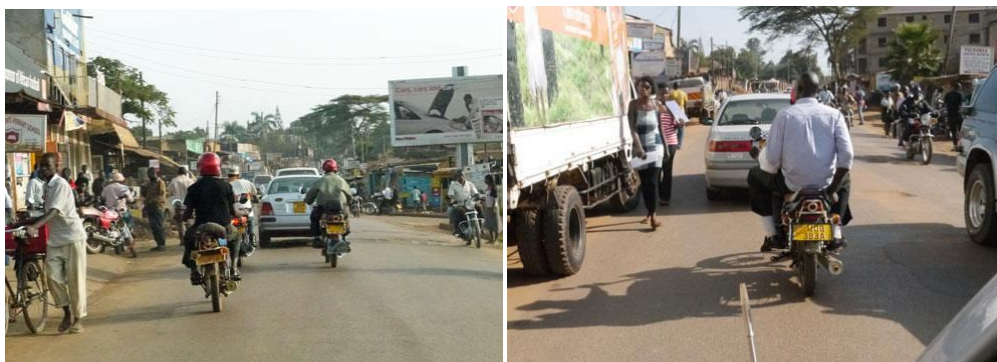
Chaotic roads providing problems for pedestrians in Kampala

Urban roads in Uganda are often chaotic, due to obstructed pedestrian infrastructure, parked vehicles, loading vehicles, taxis and motorcycles plying for trade, street vendors and pedestrians crossing everywhere. Most of these issues could be resolved through improved management and enforcement of existing regulations.