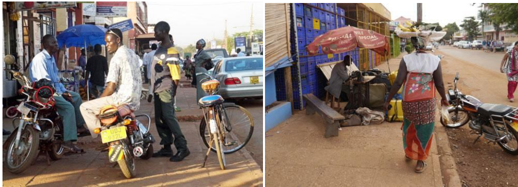
Footways in Jinja congested by boda-bodas, traders and small businesses

The central area of Jinja used to have generous footways, designed to be comfortable for pedestrians (albeit not to Universal Design principles). Now, the combination of inadequate maintenance over the years and encroachment by traders and vehicles means that pedestrians either struggle to make their way between obstructions, or walk in the road. The same problems occur in Kampala and are repeated throughout the country.