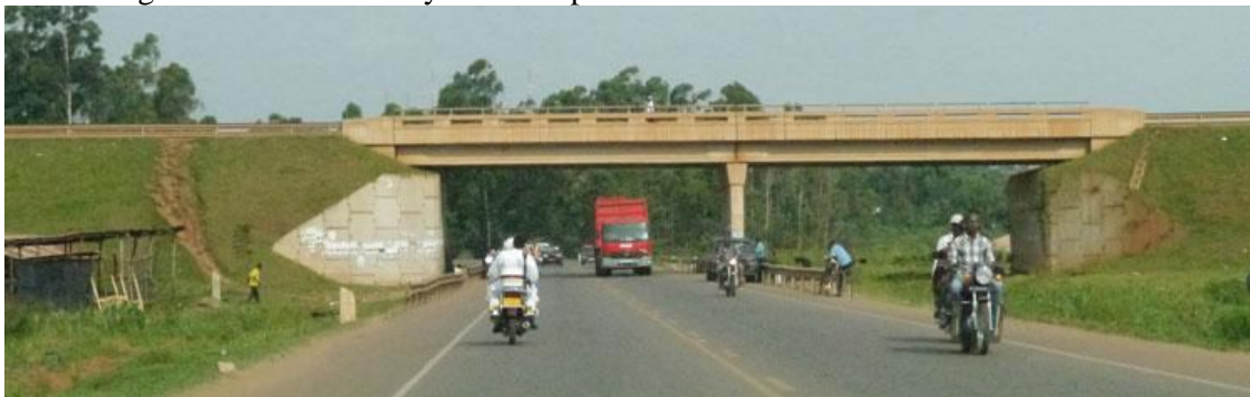
Road bridge over Kampala northern bypass

On the Northern bypass of Kampala, greater pedestrian use could be made of the various road bridges that cross the carriageway(s). Providing easy access between the bypass and the bridges, through stairs and ramps up and down the embankments, could have created safe crossing places, at very low cost. It would have also reduced the erosion caused by people ascending and descending the embankments by informal pedestrian scrambles.