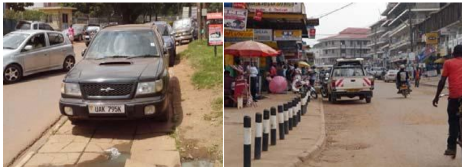
Kampala footway obstructed by parked cars (left) and footways protected by bollards in Masaka (right)

Where there is a significant risk that motor vehicles will mount the footway, in order to park or to undertake a traffic queue, footways should be protected by bollards. It is very difficult to physically prevent motorcycles from entering footways. Any infrastructure that seriously restricts motorcycle access would also be inconvenient for people, particularly those with disabilities. Therefore keeping pedestrian infrastructure free from motorcycle must depend on clear and consistent enforcement, so that motorcyclists will not risk being caught.