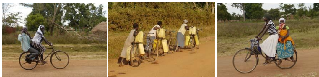
Women using bicycles for leisure, domestic water collection and accessing health care

Men, woman, children and the elderly are all pedestrians. However most means of transport in Uganda are owned and operated by men. In eastern Uganda, many women ride bicycles, although issues of cost and gender relations generally make it easier for men to own and use bicycles. In western Uganda, some girls and women ride bicycles or use them to push loads (such as water). However, there are negative cultural traditions that inhibit women's use of bicycles. These may prevent them from gaining the productive benefits that bicycles can offer (including greater efficiency of water transport).