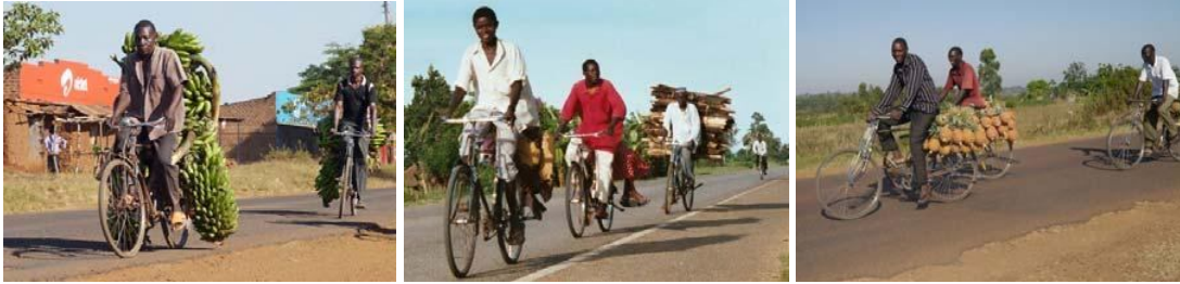
Bicyclists prefer the smooth carriageway to the rougher shoulder, unless traffic is heavy

New hard shoulders start relatively smooth, but they become rougher due to erosion, loose stones from the carriageway and deformations (heavy vehicles, local subsidence). There may also be encroachment by vegetation and various physical obstructions. As the road shoulder ages, unless it is well maintained, it becomes increasingly unfriendly for pedestrians and bicyclists, making the carriageway preferable, unless there is heavy traffic.