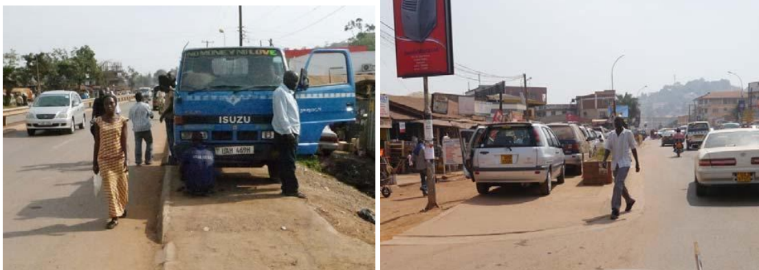
Good quality and relatively new pedestrian infrastructure in Kampala occupied by motor vehicles

In Kampala, several recently-constructed footways have been taken over by informal businesses. These include some vehicle maintenance facilities that now use the whole width of the walkway as their workshop, causing pedestrians to walk in the road. Other NMT facilities have been taken over by parked vehicles and by traders.