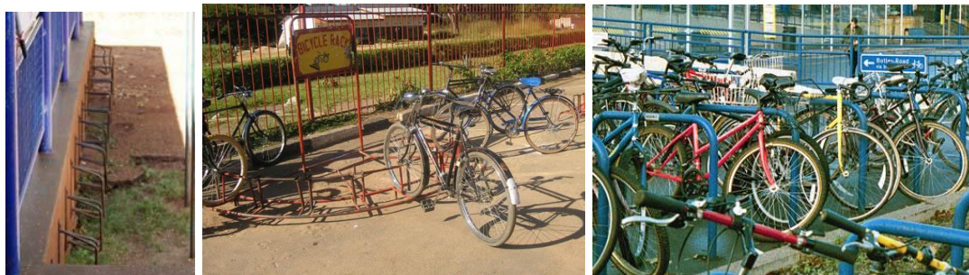
Bicycle racks. Bicycle stands offer better parking and security than front wheel racks Left: front wheel racks in Tororo. Centre: front wheel racks in Zambia. Right Sheffield stands in UK

There is very little provision for the safe parking of bicycles in Uganda. A small number of public buildings (such as the Post Office in Tororo) have been constructed with bicycle parking facilities. Similarly, some private sector buildings, such as BAT in Kampala and Bank of Baroda in Jinja have bicycle racks. Experience from other countries suggests that more people will use bicycles for journeys if they know there is safe bicycle parking at their destination. In some countries, including Burkina Faso, there are designated and supervised bicycle parking areas near markets and public buildings, with small, affordable fees collected by the attendant.