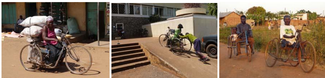
Hand-operated tricycles providing livelihoods and access to services for disabled people Left: Woman boda-boda operator in Busia; Centre: Woman entrepreneur visiting council offices in Jinja. Right: Rural men using tricycles to access health care and work options.

In Uganda, the main use of tricycles is for disabled people. The locally-made tricycles have rotating handles rather than pedals for propulsion. People who cannot easily walk can use the tricycles for personal mobility and also for income generation. The tricycles enable disabled men and women to access work places, health facilities, social and administrative services and to develop businesses. Several operate as freight-carrying ‘boda-bodas’ at the border town of Busia. The empowering effect of such tricycles on disabled people is extremely high, and they are used in both urban and rural areas. They are much more robust and stable than wheel-chairs and with a degree of physical protection from all sides, they are more suited to use on footways or roads. In practice, there are few, if any, unobstructed footways in Uganda with consistent provision of kerb ramps, and so most tricycles are used on roads. Some rural people travel to town by taxi with their tricycles carried by the taxi for an additional 50% supplement on the normal passenger fare.