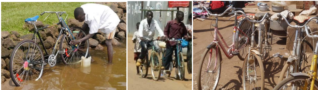
Some bicycle models in Uganda

Most bicycles are of a roadster design that has changed little since the 1950s. They do not have gears, but have rod brakes and crossbars. These are generally robust and are well adapted to having a rear load-carrier. Tens of millions of similar bicycles have been manufactured and are in daily use in India and China. However, such designs have been largely replaced in Europe and the Americas. The market leader is Roadmaster whose Indian parent company established a local assembly and manufacturing plant in Kampala in 1995. Roadmaster had a 50-60% market share in 2003. Other Indian manufactured brands include Hero and Jupiter. The main Chinese brand of traditional roadster bicycle is Phoenix. Imported Chinese mountain bicycles with gears are still quite rare, but may become increasingly common, particularly with younger people in urban areas.