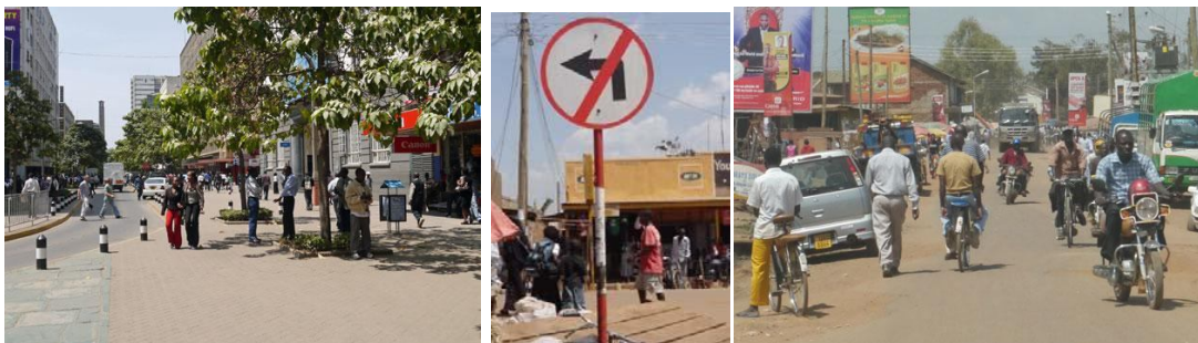
Pedestrianisation and one-way schemes in Nairobi and Iganga Left: Part pedestrianised one-way scheme in Nairobi. Centre and right: vestiges of the NMT scheme in Iganga

The proponents of the rejected Jinja scheme contacted the Iganga Town Council who agreed to work on an NMT master plan for Iganga in 2005. The existing situation was studied in detail. NMT plans were drawn up and the Town Council seemed pleased to approve them. They included a roundabout, traffic islands, pedestrian crossings, bicycle parking, one-way streets for motor vehicles (to allow more room for pedestrians and bicycles) and appropriate signage. There were participative processes to ensure wide endorsement and compliance with the new regulations and initial reactions seemed positive. However there were some vocal disagreements, with a petrol station fearing reduced sales and some stores being unhappy with the one-way system. The national roads department argued that the street that linked the council offices to the main Kampala road was a national road. Because of this, Iganga Town Council did not have the right to make it into a one-way street. These disagreements were compounded by various administrative problems and delayed payments from the donors, so that the pedestrian crossings and shaded bicycle parking facility were never constructed. The mounting problems caused people to abandon the master plan (Heyen-Perschon, 2007). Now little remains apart from some traffic islands and a few vestigial signs to what used to be the one-way street.