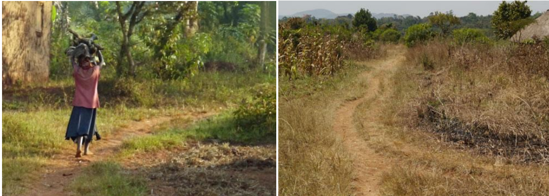
Rural footpaths: most people in Uganda use footpaths on a daily basis

countries. If it were 50%, it would mean that half of the 26 million rural people in Uganda have to walk at least two kilometres along footpaths to reach a road, a journey of at least twenty minutes each way. Some of these thirteen million people would be walking much more, and some of the remaining thirteen million people would be walking over one kilometre. This illustrates the immense importance to the people of Uganda of rural footpaths.