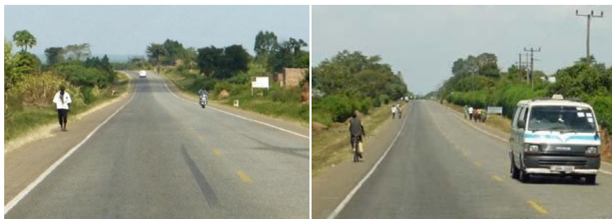
National road shoulders are currently of a consistent width irrespective of the anticipated NMT demand

The standard design of highway provides for consistent width of hard shoulder along its length, irrespective of the envisaged pedestrian and bicycle traffic. Only within trading centres, does the shoulder width increase. Here a wide and generally undefined area of additional carriageway or hard shoulder is provided to allow vehicles to stop and to load. Frequently vendors mill around vehicles and may encroach on the extended shoulder. There are also some clearly defined bus stops situated on the extended shoulder.