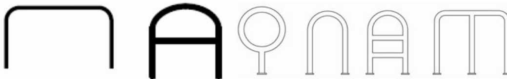
Some shapes of fixed bicycle stands The simple but effective Sheffield stand is on the far left

The old-fashioned front-wheel bicycle racks (as installed at Tororo Post Office, BAT in Kampala and Bank of Baroda in Jinja) are no longer considered appropriate due to poor security and the potential for wheel damage. Simple stands to which two bicycles can be locked are easy to install and use and are very effective. Although a variety of shapes is possible, an n-shape anchored in concrete (sometimes known as Sheffield stands) are relatively strong, cheap to provide and require little supervision or maintenance. The provision of a horizontal bar across the n (giving an A-shape) provides additional support for small bicycles, but increases the cost.