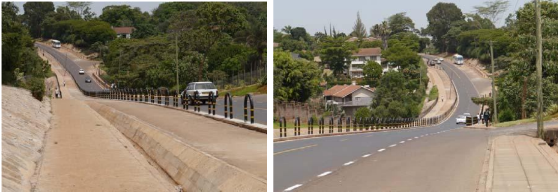
A new cycleway in Nairobi, Kenya, built by Kenya Urban Roads Authority (KURA). It is KURA policy that all new roads it constructs should have cycleways and footways.

In addition to cycle lanes along existing roads, many countries also plan for cycle routes. Some of these are ‘green routes’ that generally avoid the road network and comprise dedicated cycleways, free from other traffic. These may be for recreational use, and may make use of small tracks, bypassed roads, old railway lines, canal tow paths or covered waterways. Many towns and cities have designated cycle routes, often running between residential locations and places of work. For example, many European and Latin American cities have clearly marked routes designed to encourage safe bicycling. In the first instance, these may simply be designated roads, with clear cycle lanes. However, they may be gradually upgraded to increase bicycle flow and safety, with priority given to bicyclists at junctions, and the addition of improved infrastructure at intersections (dedicated bicycle traffic lights, cycle subways or cycle flyover bridges).