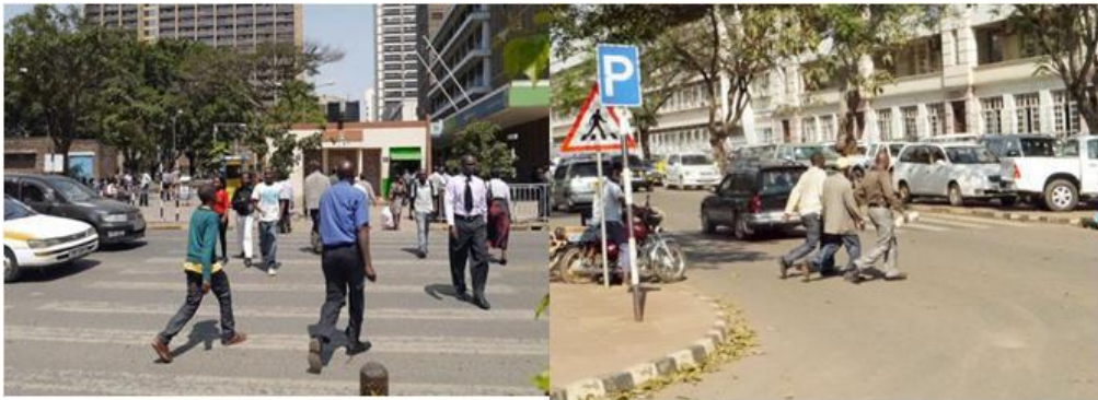
Examples of pedestrian crossings and influence of enforcement Left: Nairobi, people walking naturally and confidently on the crossing, with cars stopping Right: Kampala, people walking rapidly and with caution away from a nearby crossing

confidently. To date, the campaign has been localised and driver and pedestrian behaviour away from the enforcement area, remains poor.