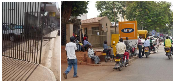
Examples of Kampala footways being obstructed by driveway infrastructure

Properties with driveways connecting to the road sometimes obstruct the walkway with small walls, bollards or signs, designed to emphasise their driveway, at the expense of the footway.