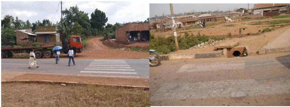
Pedestrian crossings in poor locations relative to the road infrastructure Left: Pedestrian crossing aligned with an intersection (with poor pedestrian behaviour). Right: New pedestrian crossing on northern bypass aligned with a culvert.

In Kampala and other towns, there are few traffic lights designed to allow the safe crossing of roads by pedestrians, with pedestrian lights to inform pedestrians when it is safe to cross. In contrast, there are numerous traffic lights with pedestrian phasing and pedestrian lights in Nairobi. In January 2012, one set of traffic lights in Kampala had very dangerous phasing with the pedestrian green showing at the same time as it was green for the traffic in the lane being crossed.