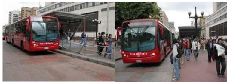
'TransMilenio' bus rapid transit system (BRT) in Bogotá, Colombia

While there are no bus rapid transit (BRT) systems in use in Uganda, these are being planned for Kampala. The central concept of BRT is the integration of transport modes. The emphasis is on high-capacity buses running on a small number of key routes (or lines) that are 'fed by' and 'deliver to' appropriate NMT infrastructure and facilities. The aim is for as many people as possible to reach the bus stops (stations) by walking or bicycling, and to also use walking or bicycling to reach their final destinations. Some of the BRT passengers living away from the BRT lines will be brought to the bus stops (stations) by feeder transport (minibuses, taxis).