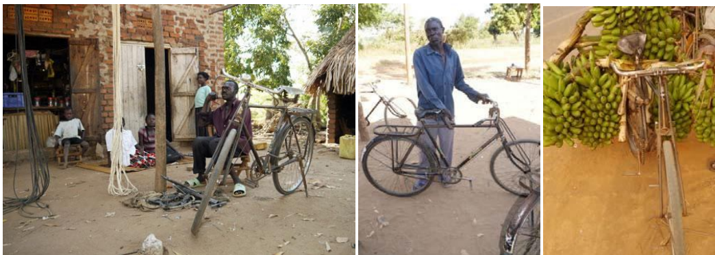
Rural bicycle mechanic and examples of bicycle condition Left: rural bicycle mechanic located by small store selling parts Centre and right: bicycles without front brakes or pedals (which is quite a common condition)

FABIO, like several other organisations in Africa, has had experience in working with Institute for Transportation and Development Policy (ITDP) to promote the California bicycle. This bicycle has gears and has been designed with Africa in mind to be modern, efficient, reliable and appealing. Through appropriate design and durable components, it is intended that the lifetime cost of ownership should be affordable. However, the uptake in Uganda and elsewhere has been disappointing, even at a subsidised price. While there is a small demand for ‘up-market’ bicycles, the main demand in Uganda appears to be for low cost bicycles (highest priority) that are robust and easy to maintain.