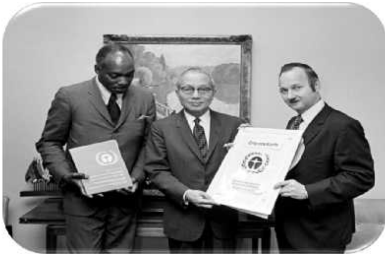
Presentation of Stockholm Conference Poster to Secretary-General U Thant (1971)

“To provide leadership and encourage partnership in caring for the environment by inspiring, informing, and enabling nations and peoples to improve their quality of life without compromising that of future generations”.