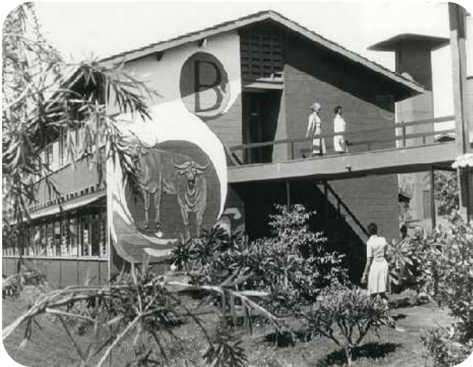
Temporary UNEP HQ in Nairobi(1978)