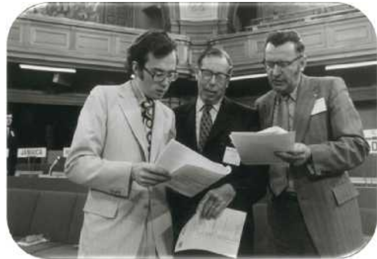
Delegates discussing a document at the Conference (1972)