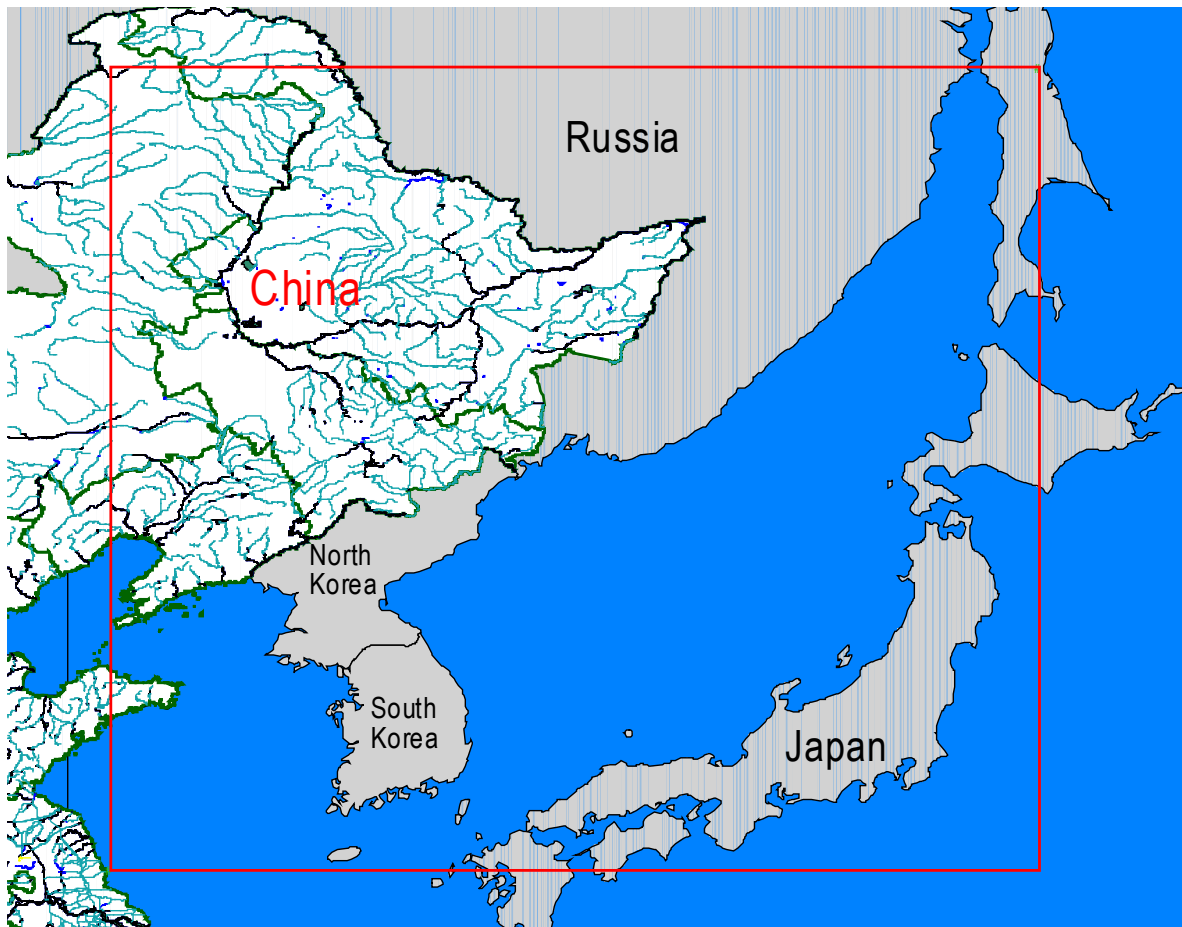
Figure 1. Geographical scope of the NOWPAP region.

The Northwest Pacific Action Plan (NOWPAP) region's geographical coverage include the marine environment and coastal zones of the following countries : Japan; People's Republic of China; Republic of Korea; and, Russian Federation. The geographical scope of the NOWPAP region covers marine, coastal/near shore coasts and offshore basins at these coordinates are from about 1210E to 1430E longitude, and from approximately 330N to 520N latitude (Figure 1). This geographical coverage was according to an agreement among China, Japan, ROK and Russia (1994/97) based on United Nation principles, without prejudice to the sovereign right of any State.