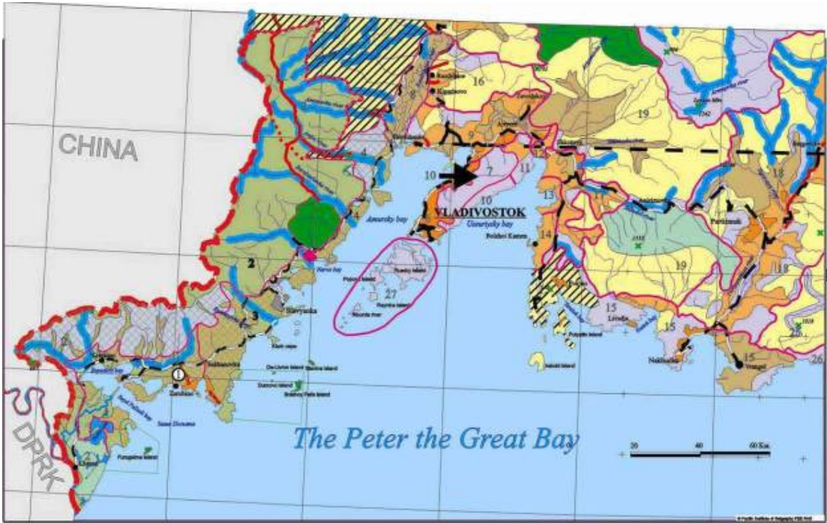
Figure 3. The natural-economic districts of the Peter the Great Bay.

In Russia, there is functional zoning of coastal territories (see Figure 4). The goal is to develop and realize the developmental programs of natural-economic complexes of coastal zones for natural-economic districts of Krai and oblasts of the Russian Far East. This zoning is in connection with the agreed goals for the regional development. This takes into account the local peculiarities of the natural resources/environment and the level of social-economic development. In terms of process, it involved the systematic-structural analysis of database, thematic maps and atlases, as well the evaluation of literary and archival records. Zoning was aimed to determine essential directions in the developmental programs of the territories. It was also designed to create the mechanism for complex management of the coastal zones at the level of partial natural-economic territories within the subjects of the Russian Federation.