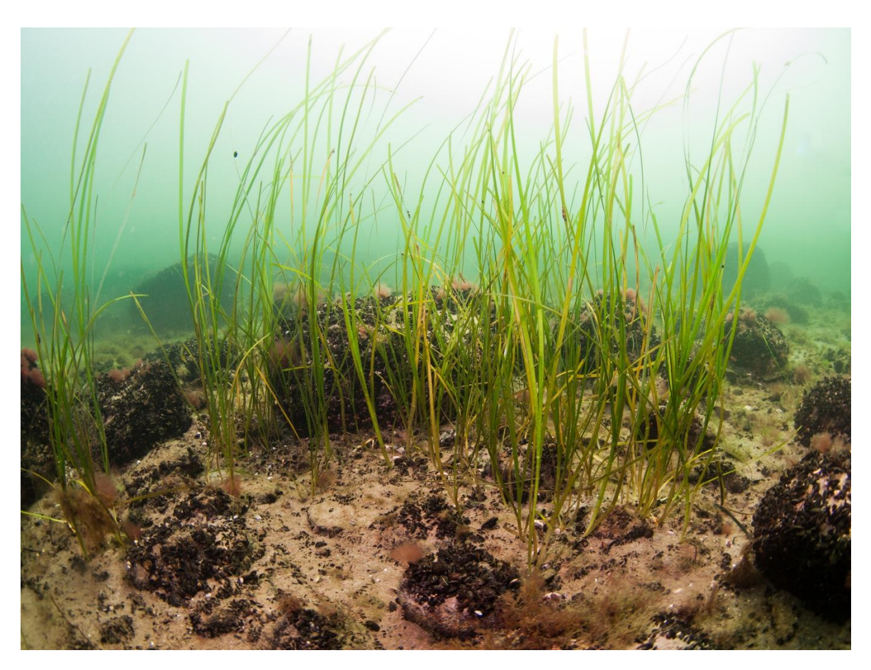
Common eelgrass (Zostera marina) on sandy bottom surrounded by erratic boulders

Planning process<sup>11</sup>. Furthermore, these plans are developed at different strategic levels and geographical scales.