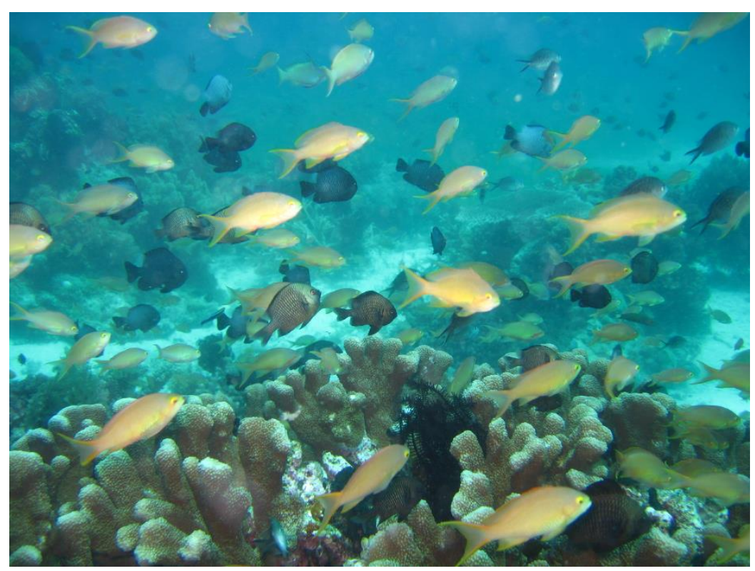
Coral reefs with abundant fish-life attract thousands of divers and snorkelers annually to Bohol Island, Philippines

The Bohol Province Integrated Coastal Zone Management program initially operated from 1996 to 2005, across six municipalities, each with five or six sites. The program involved the participation of the local community to undertake coastal resource management plans leading to Integrated Coastal Zone Management. The plans made were initially focused on marine issues, but specific measures were included to address limited terrestrial issues. This includes land-based pollution and coastal development. The programme covered the jurisdictional boundary of the municipality up to 15 kilometres offshore. Plans were based on scientific and participatory processes, and reviewed and adapted every year. The authority to approve the plans fell within the remit of the local municipal governments. Due to the success of the programme in the Bohol province and several other cases in the Philippines, the Integrated Coastal Zone Management approach was officially adopted under national law.