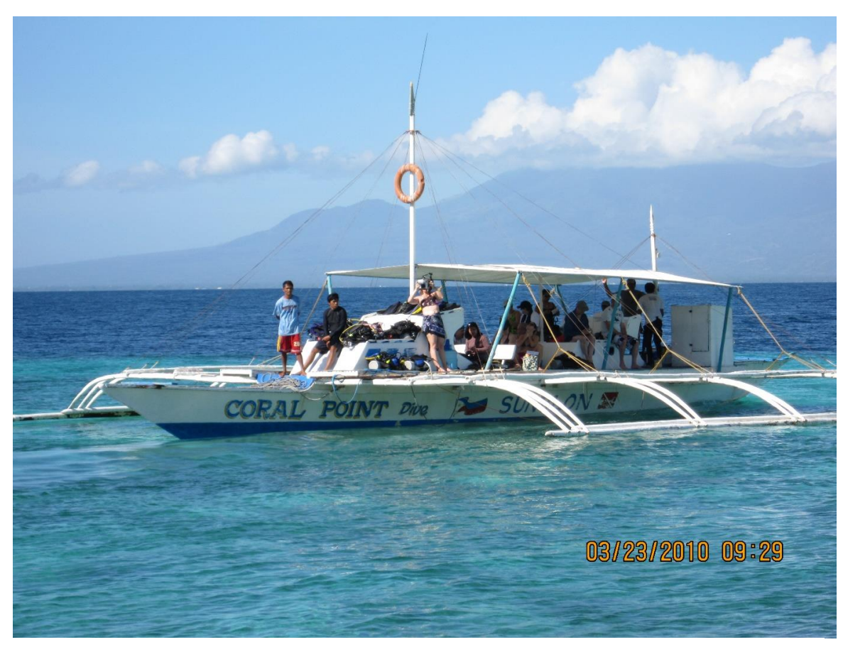
Typical tourist dive and island hopping boat in Bohol Island and Visayas, Philippines