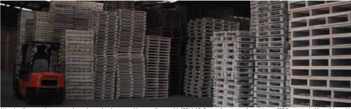
Wood pallets carrying exported goods need to be treated in compliance with ISPM-15. Presently approved treatments (IPPC) are methyl bromide and heat

Although Parties to the Montreal Protocol are obliged to officially report production and consumption of methyl bromide (MB) for Quarantine and Pre- shipment (QPS) purposes under Article 7 of the Protocol, such production and use is exempted from controls¹. This is particularly important now that the deadline for final phase-out of controlled uses (i.e. pre-plant soil fumigation, stored foodstuffs, structures and others) has passed: 2005 for non-Article 5 (non-A5) Parties and 2015 for A5 Parties². This QPS exemption for MB has the potential to provide a continuous and unlimited source of MB. Since consumption for QPS shows an upward trend in A5 Parties over the last 10 years, various A5 Parties are expressing concern over illegal trade and/or use,