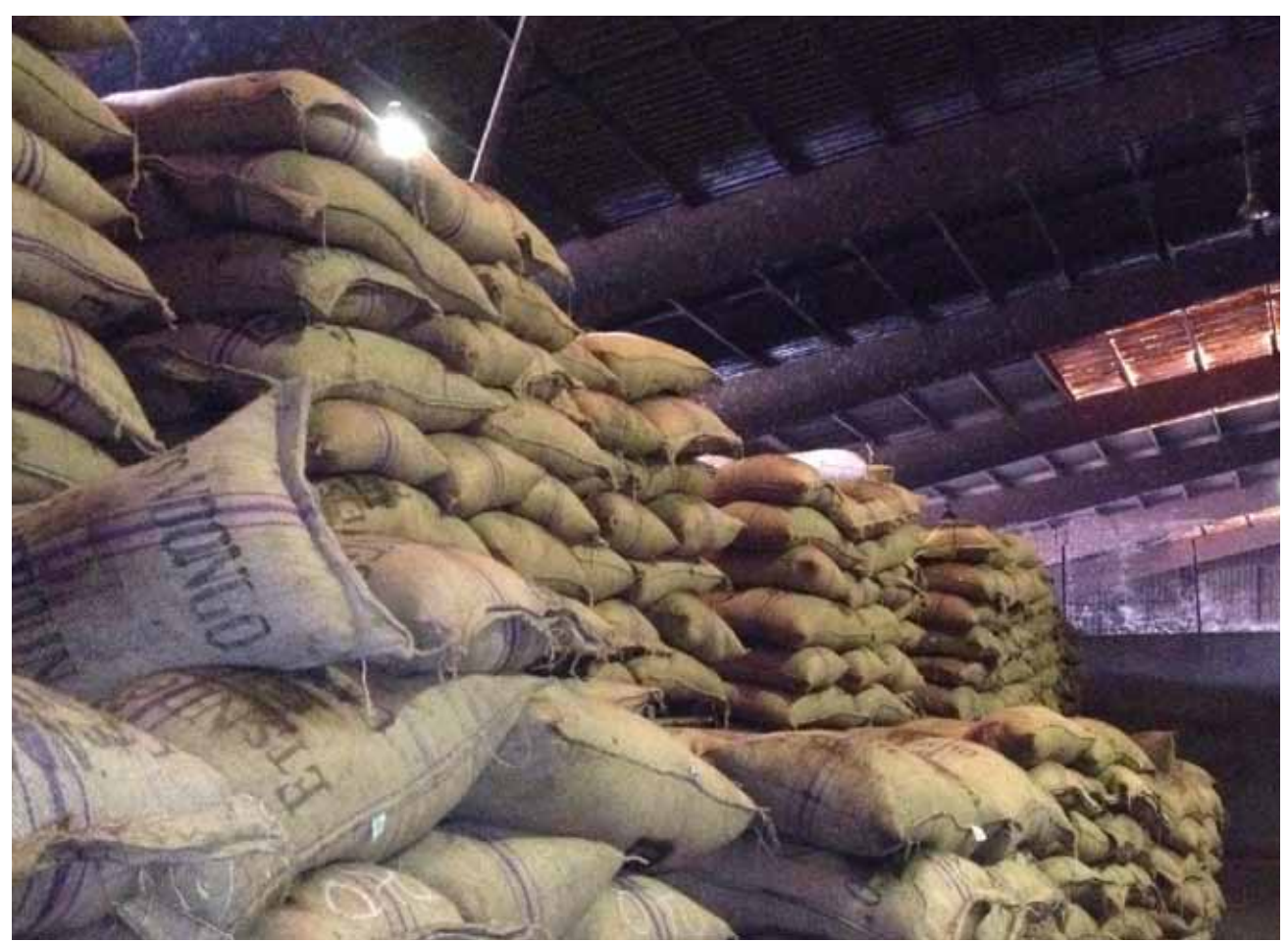
Stored cocoa beans in Cameroon need pre-shipment treatment. This should be done, at maximum, 21 days before export.

UNEP 2013. Enforcement strategies to combat illegal trade in HCFCs and Methyl Bromide. UNEP, Paris, 74 pp. Yilmaz. S. 2015 Personal communication. MBTOC member, Turkey.