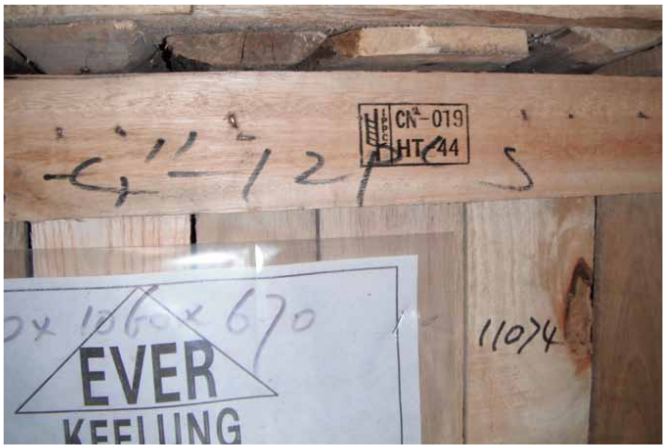
Wooden pallets from China showing the required IPPC stamp for heat treatment, in compliance with ISPM-15