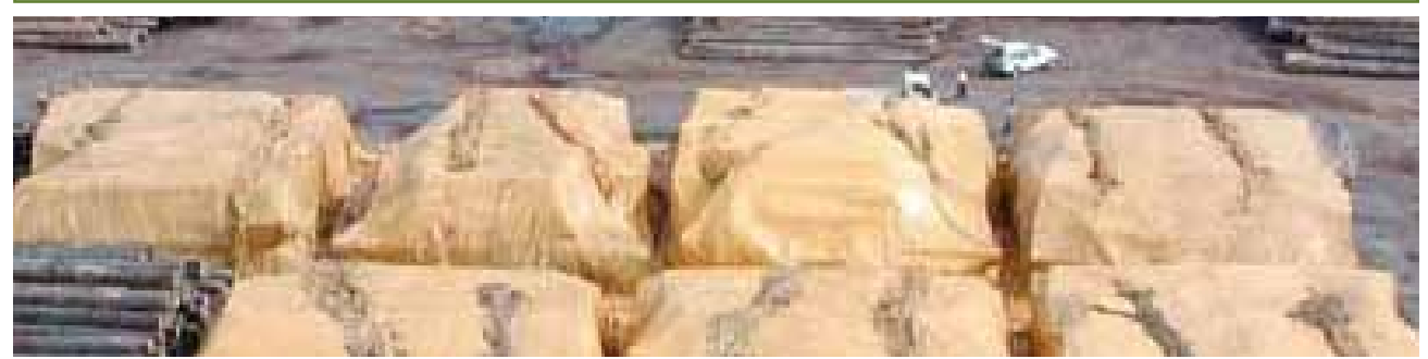
Applying MB under sheets to imported logs as a quarantine treatment in Japan

Treatments required by companies, banks (letter of credit) or other commercial entities are not considered QPS and count as controlled MB consumption.