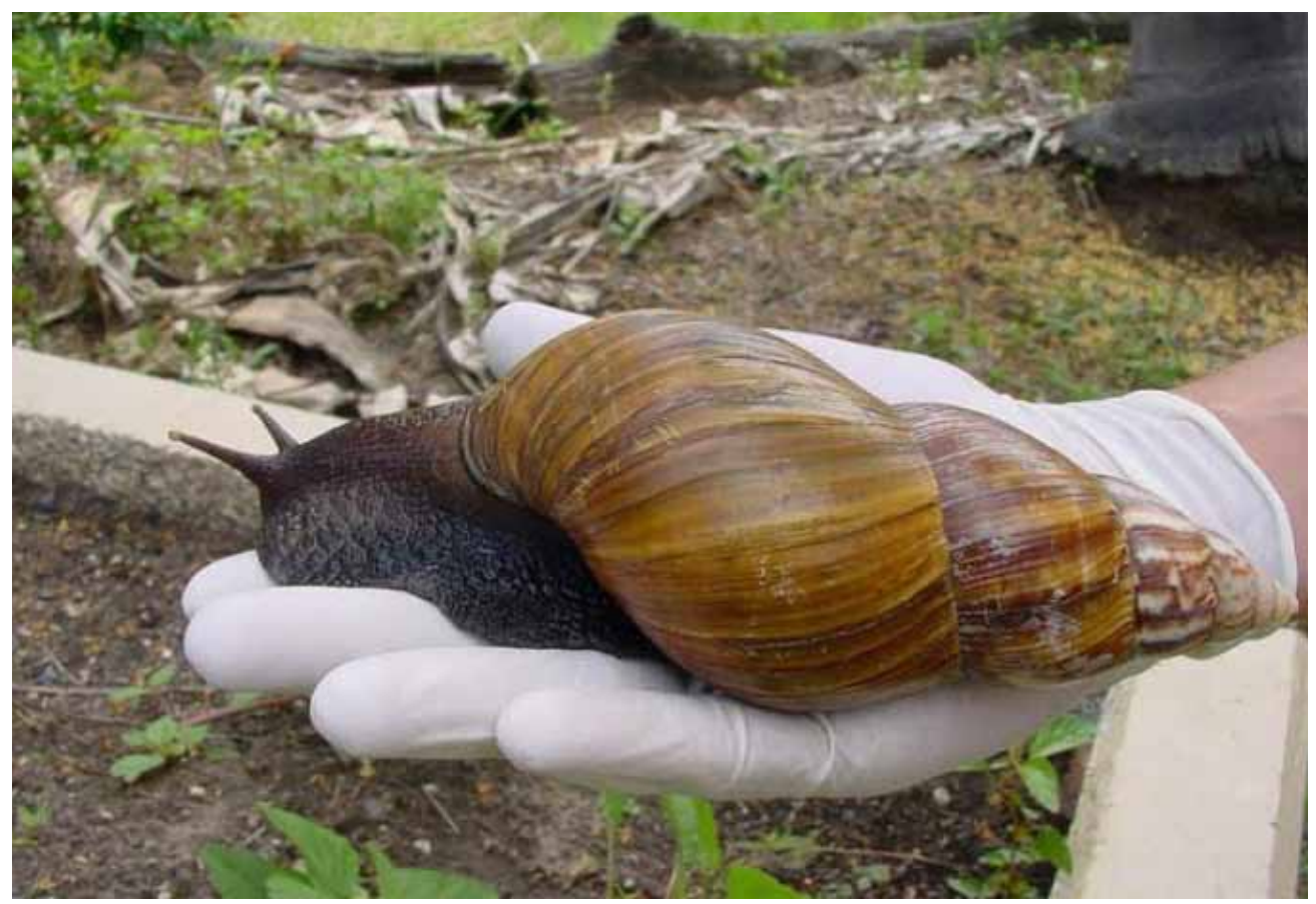
The giant African snail Achatina fulica is a quarantine pest for many countries. Very high dosages of MB are needed for its control (Source, UNEP/IPPC, 2008)