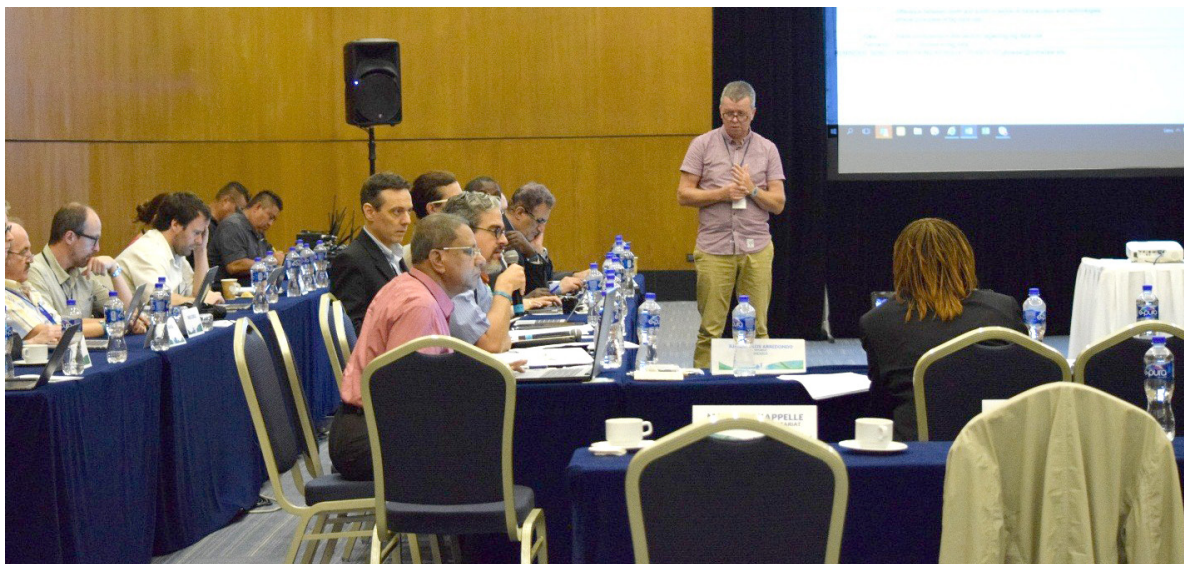
A session of the Drafting Meeting in Progress

Along with the main draft Summary for Policy Makers a two-page draft Summary for Ministers was prepared and agreed by the High-level Group. Co-chairs of the assessment, co-chairs of the Scientific Advisory Panel and authors were given one week to verify any line of sight issues between the new draft of the Summary for Policy Makers , the draft Summary for Ministers and the main Global Environment Outlook report. Any line of sight issues identified by the co-chairs or authors was presented to the High-level Group for approval. Copy and science editing will be performed on the draft Summary for Policy Makers and Summary for Ministers before they are translated for Member States.