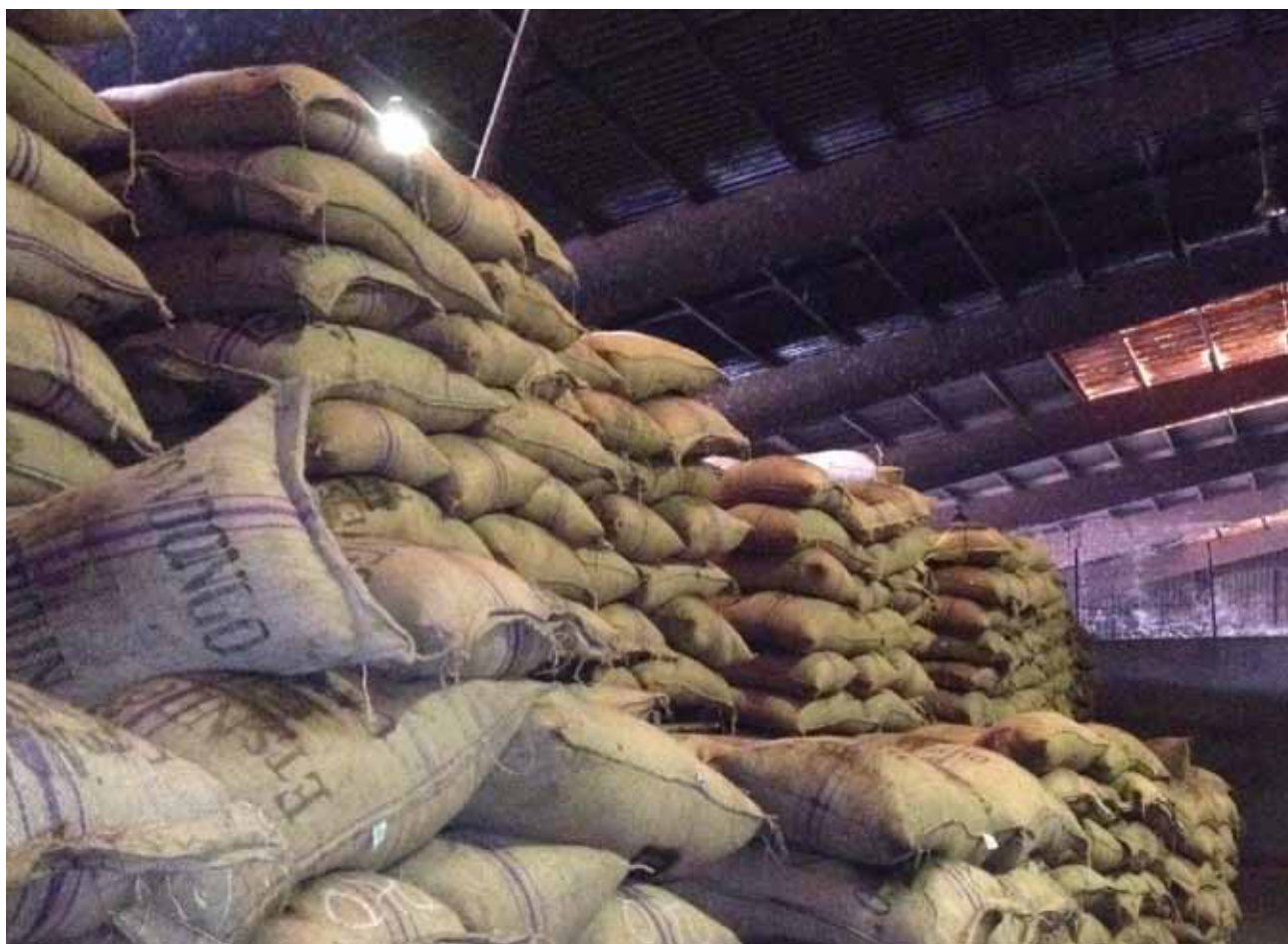
Stored cocoa beans in Cameroon need pre-shipment treatment. This should be done, at maximum, 21 days before export.

UNEP 2013. Enforcement strategies to combat illegal trade in HCFCs and Methyl Bromide. UNEP, Paris, 74 pp. Yilmaz, S. 2015 Personal communication. MBTOC member, Turkey.