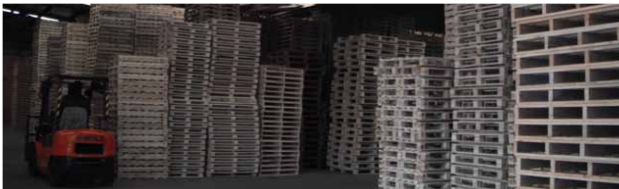
Wood pallets carrying exported goods need to be treated in compliance with ISPM-15. Presently approved treatments (IPPC) are methyl bromide and heat

Although Parties to the Montreal Protocol are obliged to officially report production and consumption of methyl bromide (MB) for Quarantine and Pre-shipment (QPS) purposes under Article 7 of the Protocol, such production and use is exempted from controls 1 . This is particularly important now that the deadline for final phase-out of controlled uses (i.e. pre-plant soil fumigation, stored foodstuffs, structures and others) has passed: 2005 for non-A5 Parties and 2015 for A5 Parties 2 . This QPS exemption for MB has the potential to provide a continuous and unlimited source of MB. Since consumption for QPS shows an upward trend in A5 Parties over the last 10 years, various A5 Parties are expressing concern over illegal trade and/or use,