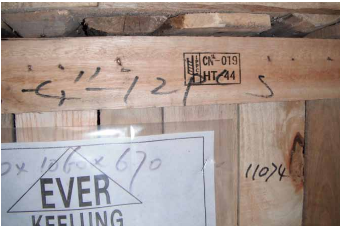
Wooden pallets from China showing the required IPPC stamp for heat treatment, in compliance with ISPM-15