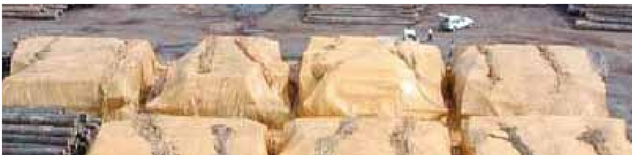
Applying MB under sheets to imported logs as a quarantine treatment in Japan

Treatments required by companies, banks (letter of credit) or other commercial entities are not considered QPS and count as controlled MB consumption.