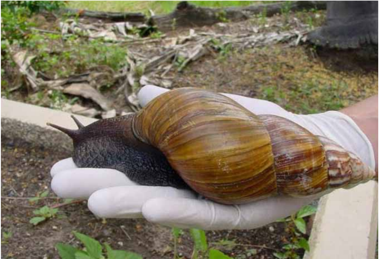
The giant African snail Achatina fulica is a quarantine pest for many countries. Very high dosages of MB are needed for its control (Source, UNEP/IPPC, 2008)