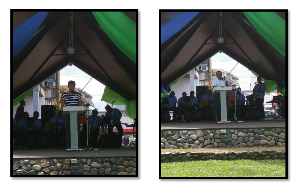
Caption: Ozone Awareness at the Sukuna Park (Public Park) during Climate Change week

The ODS Unit was part of the public awareness raising speaking on ozone depletion and climate change and how the ozone layer was being depleted by ozone depleting substances and at the same time contributing to global warming. It was an opportunity to inform the public on the obligations that the country had on the Montreal Protocol and what practices could be done to promote and save the ozone layer and also minimise global warming.