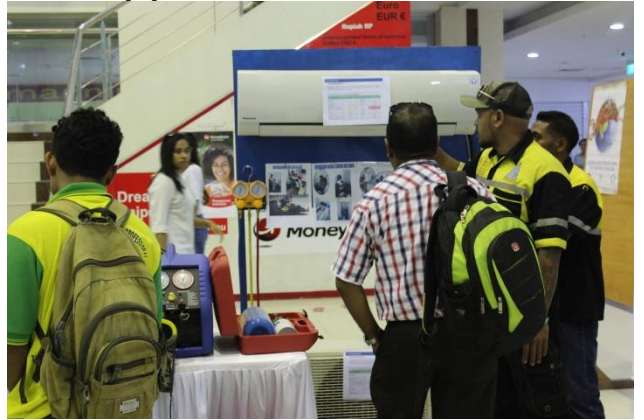
Servicing workshop owner explained the details on R-32 AC as ODS alternative