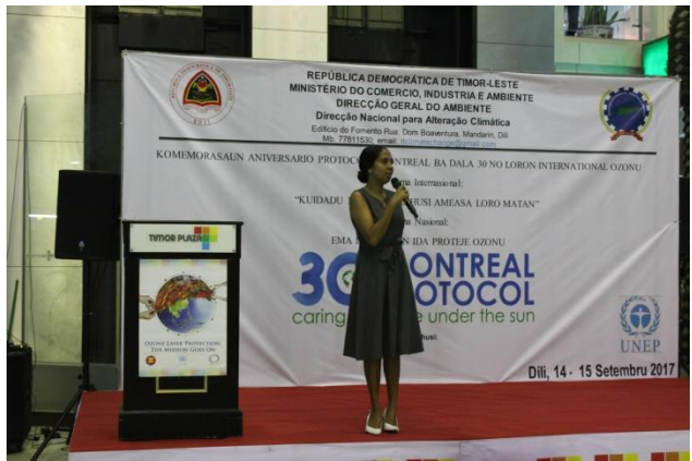
Master of Ceremony on first day of IOD