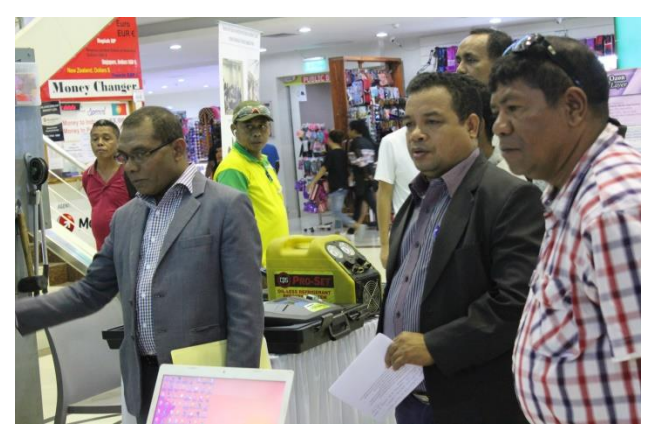
Minister of MCIE, DGE, staff DGE were looking at the RAC tools and equipment