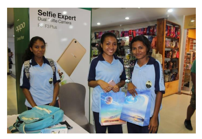
Students who won the gift from Ozone Day Quiz