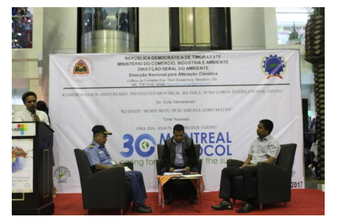
Interactive talk session