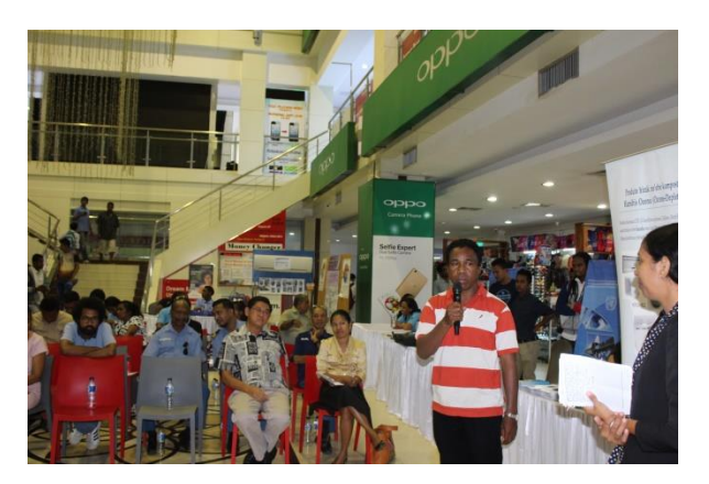
Question from one of the participants to the panel