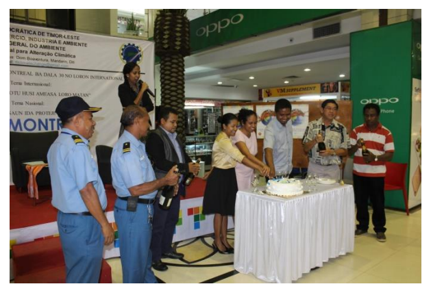
Cutting Ozone Day cake