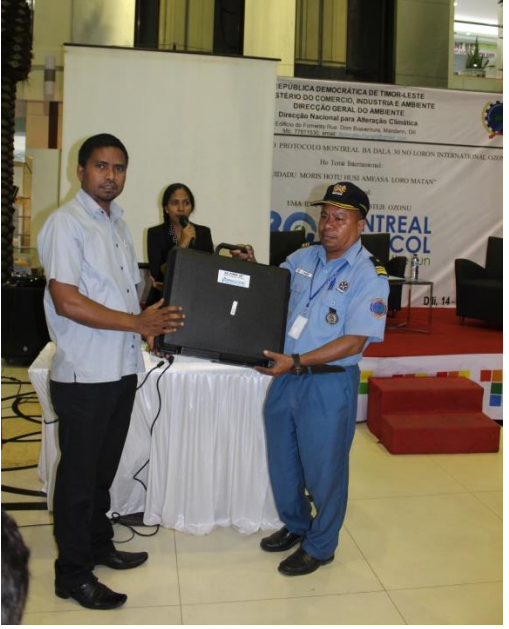
Hand-over identifier machine to the Customs Department