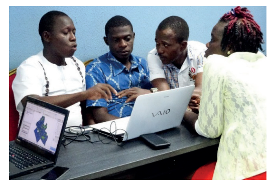
Above: Participants in training events on spatial analyses for REDD+ planning in Liberia and Viet Nam.

Below: Countries participating in REDD+ readiness, through membership of the UN-REDD Programme, Forest Carbon Partnership Facility or both. Due to wide participation among developing countries rich in biodiversity, initiatives to support integration of REDD+ planning with other goals have great potential for synergies with the Sustainable Development Goals and Aichi Biodiversity Targets.