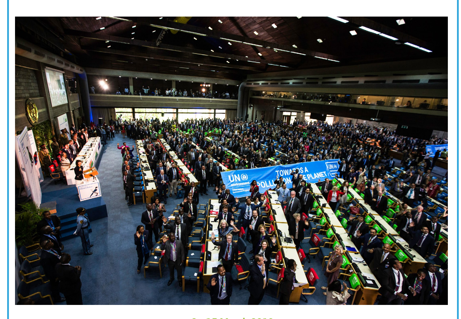
8 - 15 March 2019 Nairobi, Kenya