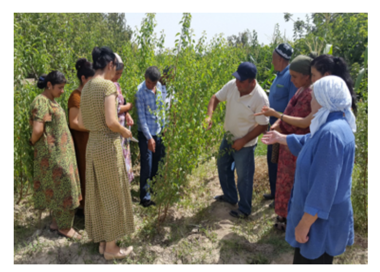
Training on cultivation technology of target fruit crops seedlings in Surkhandarya province