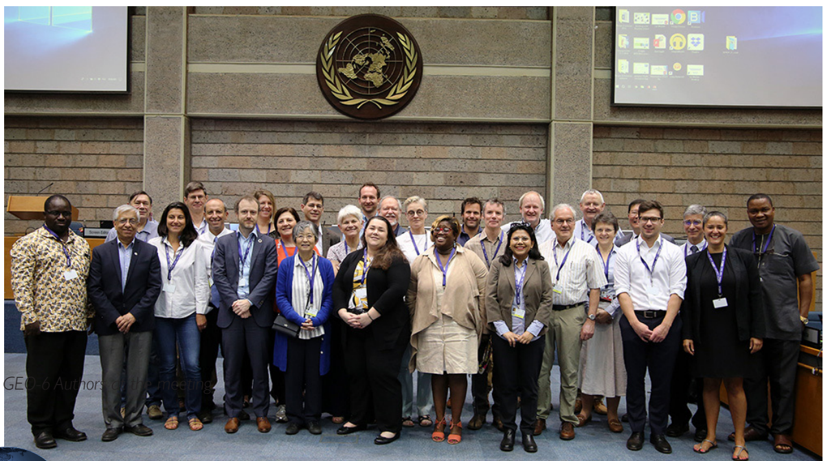
GEO-6 Authors at the meeting

The United States of America called for a stronger focus on data and science informing policy, pointing to the need for clarity in the section on air pollution. The Russian Federation noted the importance of the endorsement of the GEO-6 report and Summary for Policy Makers by the fourth United Nations Environment Assembly. Costa Rica lauded the scientific legitimacy of the GEO-6 report, particularly in support of achieving the Sustainable Development Goals. Japan mentioned that the scientific narrative is well presented. The UK suggested provision of definitions for certain statements of level of confidence. The Democratic Republic of the Congo suggested that a statement on the contribution of peatlands to carbon storage notes that most peatlands in the Congo Basin remain pristine. The Netherlands raised questions about some of the graphics used in the draft SPM, noting, for example, that the timeline used in one graphic did not match the timeline used in the related text. Kenya said the SPM should call for investment into biodiversity awareness-raising campaigns. For more country comments, please click here .