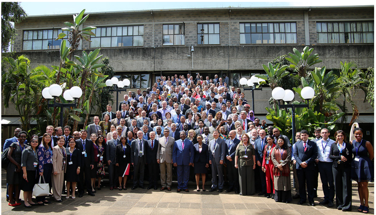
Group Photo at the opening of the conference

During the four-day meeting, delegates discussed the SPM and negotiated and amended text resulting in a final document that was agreed on the last day of the meeting. The intergovernmental meeting considered the second order draft of the Summary for Policy Makers which was developed at a meeting convened by the High-level Intergovernmental and Stakeholders Advisory Group on 24-27, September 2018 Cancún, Mexico. The final document will be presented for endorsement at the fourth session of the United Nations Environment Assembly (UNEA-4) which will be held from 11-15 March 2019. This endorsement is expected to raise the profile of the sixth edition of the Global Environment Outlook.