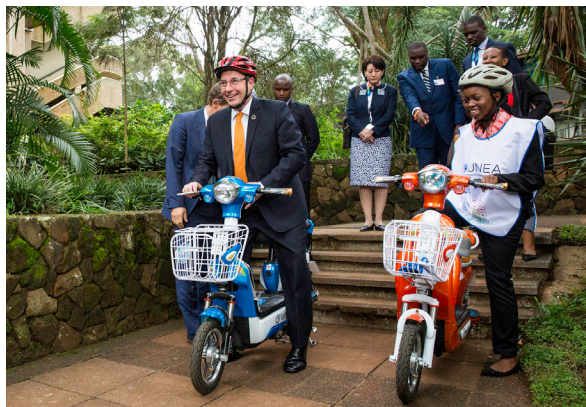
Former UNEP Executive Director, Mr. Achim Steiner, opening the Sustainable Innovation Expo 2016.

The conclusions of the Expo have planted the seeds for UN Environment's growing engagement with the private sector, particularly in view of the new partnerships that will develop between UN agencies, governments, the private sector and the international community, amongst others, as a result of the ideas and experiences shared. Moreover, it is this outcome and these partnerships that are nurturing the preparations now underway for the third session of the UN Environment Assembly that will take place in December 2017.