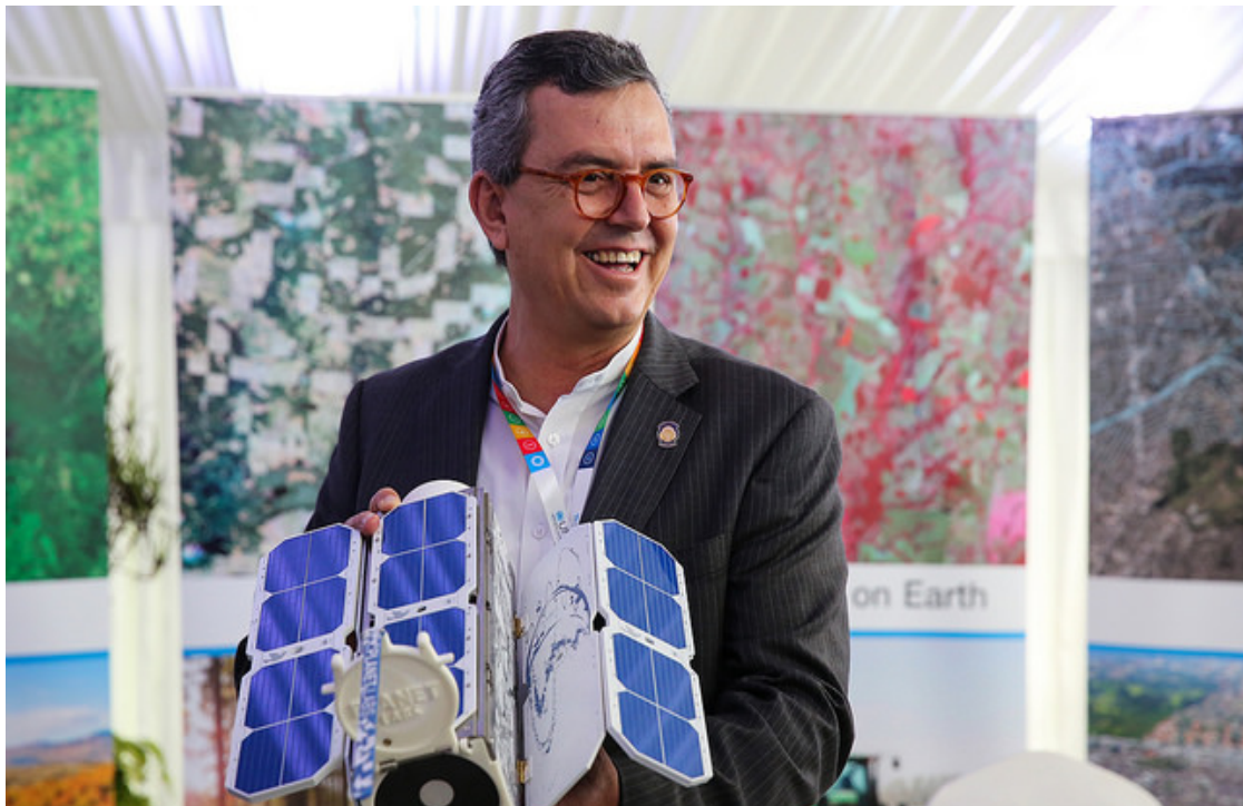
UNEA-2 President, Mr. Edgar Gutiérrez Espeleta, attending the Sustainable Innovation Expo 2016.